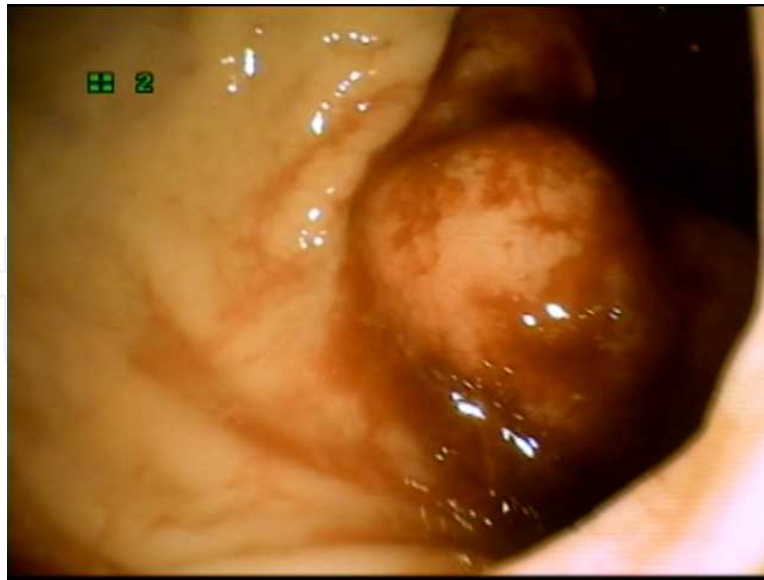
Figure 1. Bleeding polyp of the sigmoid

Excavated injury at risk of bleeding are either cracks, ulcerations or ulcers. Cracks are extremely narrow linear ulcerations that generally go deep and may be covered by necrotic or hemorrhagic debris. Ulcerations are superficial, up to 2 mm deep, with a more or less regular outline, having a diameter of 4-5 mm; they are generally acute. The ulcer (niche) represents a loss of substance above 2-3 mm, with generally well-cut edges. Their shape varies depending on the age of the lesion.