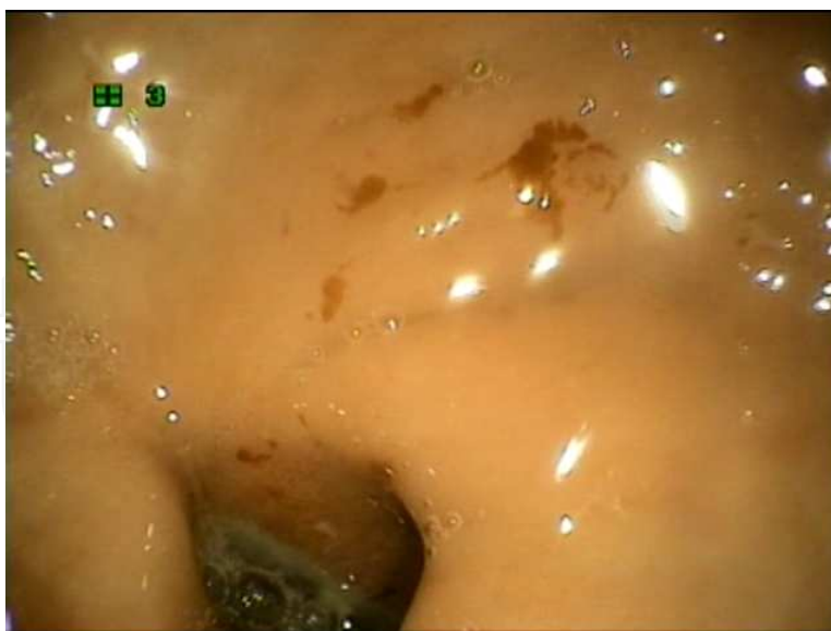
Figure 3. Gastric angiodysplasia and duodenal ulcer

ment intervention is comparable to surgical prognosis [54]. The management of rebleeding after endoscopic treatment and correct medical treatment depend largely on local expertise and clinical judgment [53]. Endoscopic or surgical treatment decision after rebleeding obviously depends on the age, associated diseases and bleeding stigmata. Thus, a patient duodenal ulcer with a giant rear face with stigmata of recent hemorrhage requires surgical intervention, while a young patient without leather rot associated with a small curvature gastric ulcer on endoscopy can be restated. “Second-look” endoscopy is controversial, published studies have demonstrated only a smaller proportion of rebleeding, but the same survival and required surgical intervention [55]. Repeat endoscopy is indicated in patients with clinical suspicion of rebleeding (hematemesis, melena, tachycardia, decreased pressure). Although some patients require direct surgical intervention, the majority of repeat endoscopy are indicated to confirm rebleeding [53].