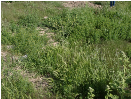
Lolium temulentum in the plot