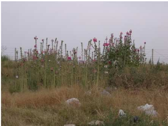
The second autumn in the study area