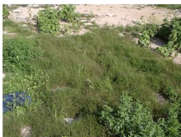
C. dactylon plot