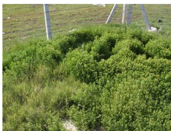
M. officinalis plot