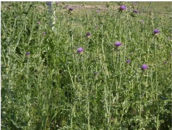
Silybum marianum in the plot