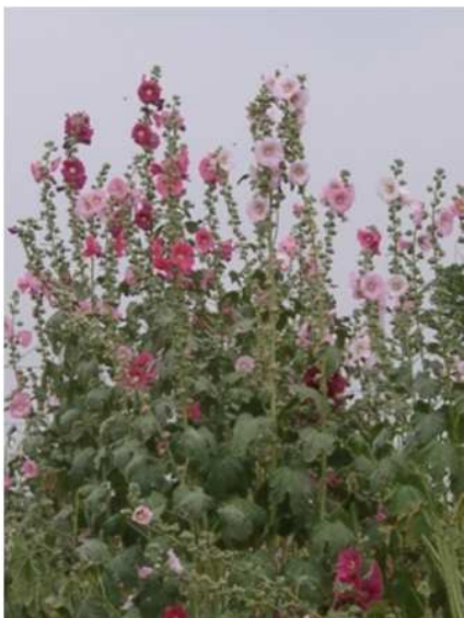
A. rosea plant group in the plot (Original)