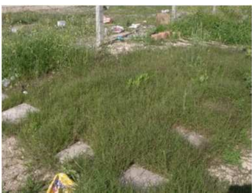
C. dactylon covering in the plot (Original)