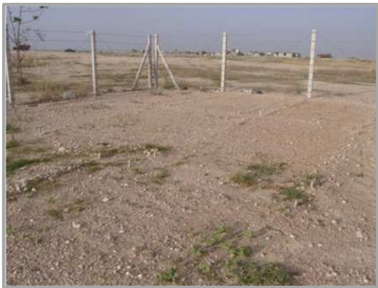
The first spring in the study area