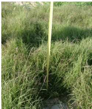
C. dactylon (Bermuda grass) (Original)