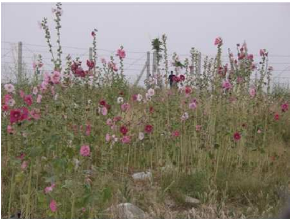
The first autumn in the study area