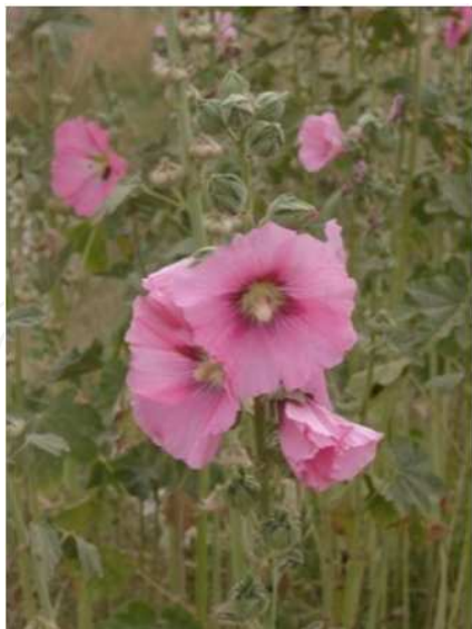
A. rosea flower (hollyhock) (Original)