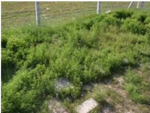
M. officinalis flower (yellow melilot)(Original) M. officinalis plant group in the plot (Original)