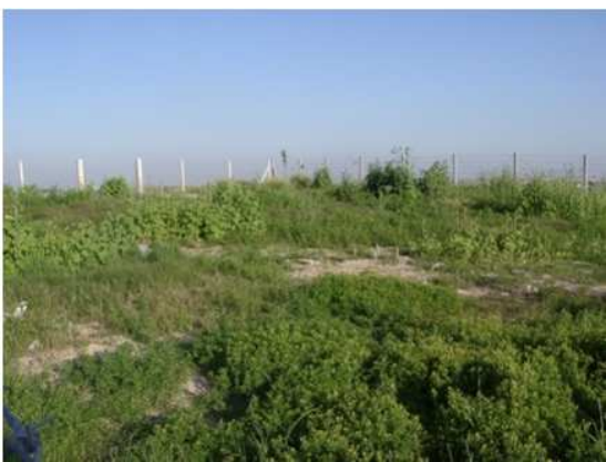
The second spring in the study area