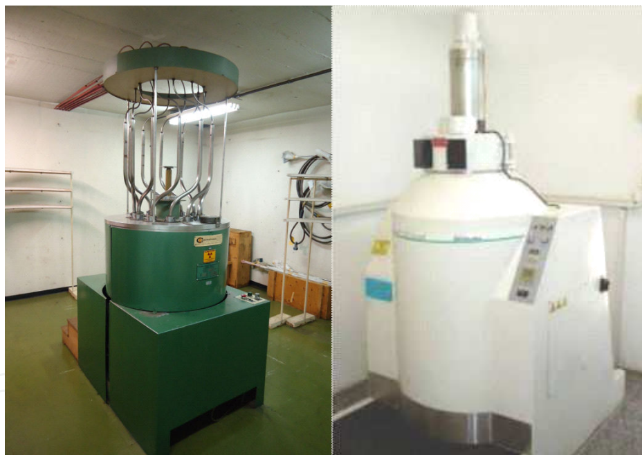
Figure 2. Types of gamma irradiators used in pest control trials or for disinfestation of commodities at the Center for Nuclear Energy in Agriculture (CENA, São Paulo, Brazil): (left) large-scale panoramic Gammabeam-650 irradiator; (right) self-contained Gammacell-220 irradiator.

Despite these advantages, the types of irradiator used most frequently by radioentomologists for the past four decades have been those equipped with the radioisotopes ^{60}\text{Co} or ^{137}\text{Cs} as source of gamma rays. ^{60}\text{Co} has a half-life of 5.3 years and emits two gamma photons of 1.17 and 1.33 MeV, while ^{137}\text{Cs} has a half-life of 30.1 years and emits a monoenergetic photon of 0.66 MeV. The gamma irradiators used in pest control programs or for disinfestation of commodities are commonly of two types: large-scale panoramic irradiators or self-contained dry storage irradiators (Figure 2). The choice of radiation source is based considering basically costs, penetration, and irradiated material throughput [11]. Panoramic irradiators allow the irradiation of entire rooms and large number of samples or products can be irradiated at the same time. In self-contained irradiators, such as the most common irradiator used for insect sterilization, the Gammacell-220 (MDS Nordion International Inc., Ottawa, Canada), the canister containing the samples is lowered from the loading position to the shielded chamber with the radiation sources. The production of the Gammacell-220 was discontinued since 2008. On its place, appeared new models whose irradiation chamber contains a single source, lowering the overall costs, and the sample rotates through its own axis in front of the radiation source.