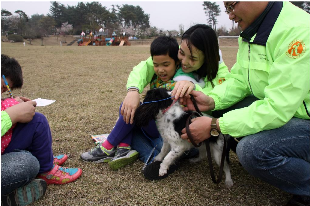
Figure 2. Animal-assisted therapy program for the children with autism

Figure 2 shows an animal-assisted therapy program for the children with autism in Korea. We summarized the benefits of animal-assisted interventions in Figure 3.