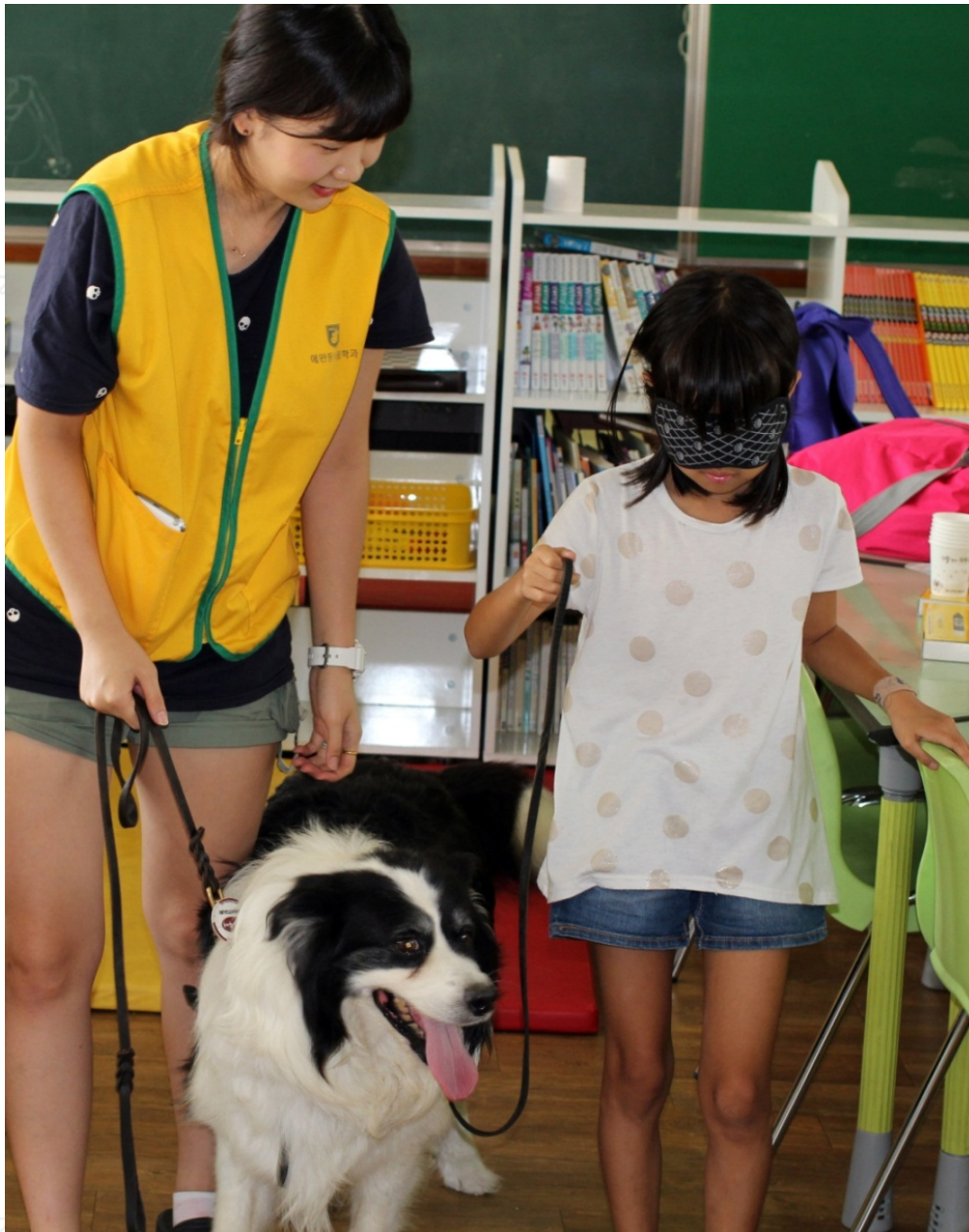
Figure 5. Animal-assisted therapy program for children with depression

well-being. This includes men, women, and children of all ages who have had pertinent precautions and safety issues addressed. Specific medical indications include but are not limited to autism, dementia, chronic diseases, mental disorders, and neurological disorders including aphasia and epilepsy [19–24].