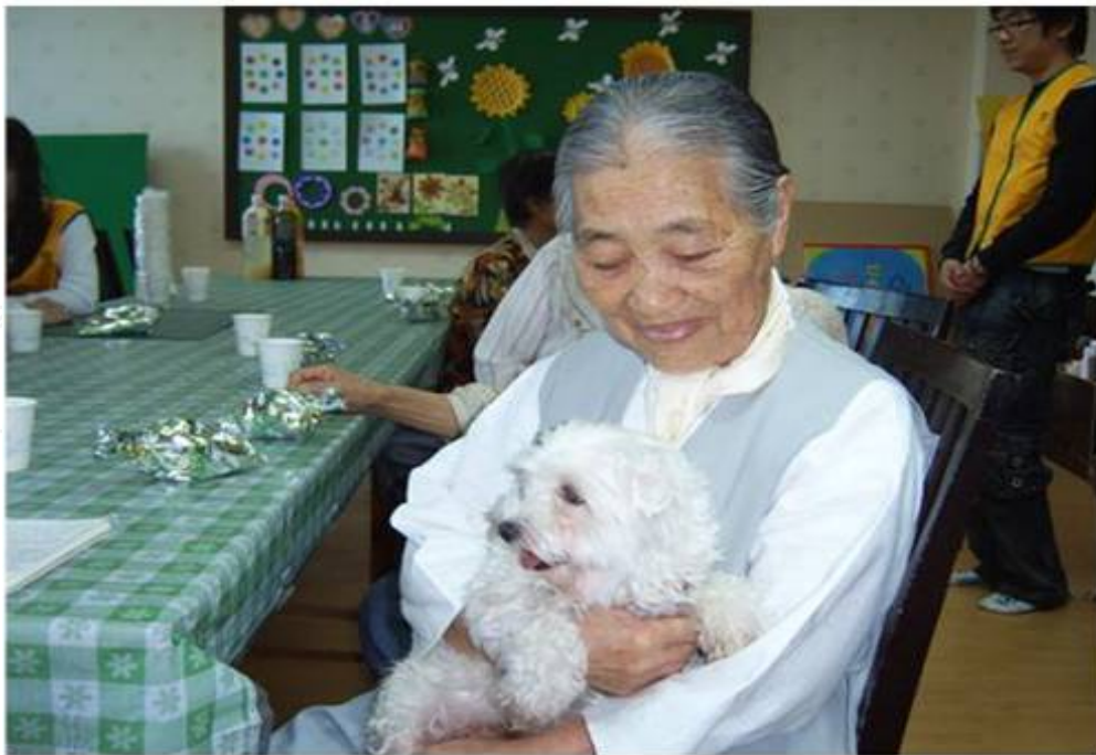
Figure 4. Animal-assisted therapy program for the elderly with dementia

cated animals to respond affectionately to human attentions and to elicit pro-social behavior and positive effect may serve as an emotional bridge to mediate interactions in therapeutic contexts [14].