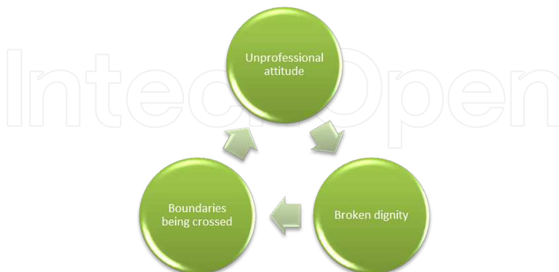
Figure 3. The circle of the key categories

Midwives are supposed to be supportive, empathic and acting as advocates for women. The environment in which they are working should be such that the midwife is, as Field [27] stresses, able to expect the support and empathy from colleagues. This is even more important when a midwife is also a mentor to midwifery students who are sent to clinical practice. The desirable mentor qualities, as pointed out by NHS [28], are – among other qualities, personal characteristics and behaviours – acting as a role model, awareness of own practice and positive attitude towards students. It was in the first year when we had clinical practice in the delivery room, I was assigned to work with an older midwife, and she was also my clinical mentor. She told me nothing, she kept leaving me alone in the room. When I asked her something she answered in a rude manner. I was on my own, scared and I remember I was forced (by that mentor) to give an enema to a woman who didn't want it. (Zarja)