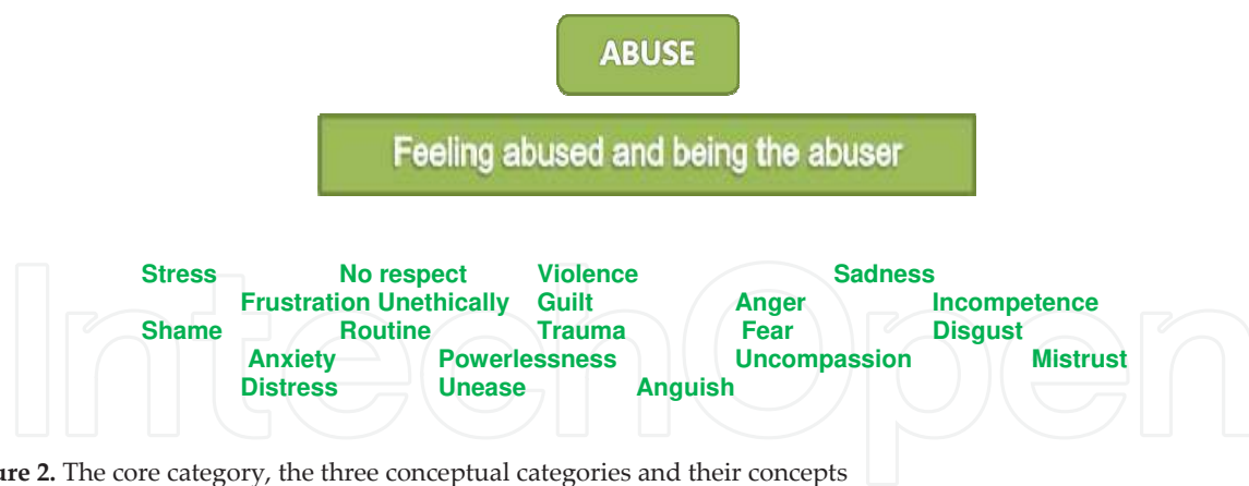
Figure 2. The core category, the three conceptual categories and their concepts

your pocket and go, the women won't even know that you are a student!" and that makes it even worse. At that point (pause) just checking the uterus (pause) it's hard... you have a feeling that you are violating her (pause) with your presence, with your hypocrisy doing something the mentor told you to do. (Lila)