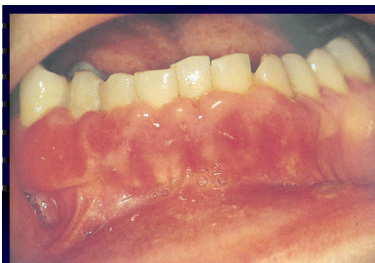
Figure 5. Cyclosporine induced gingival hyperplasia