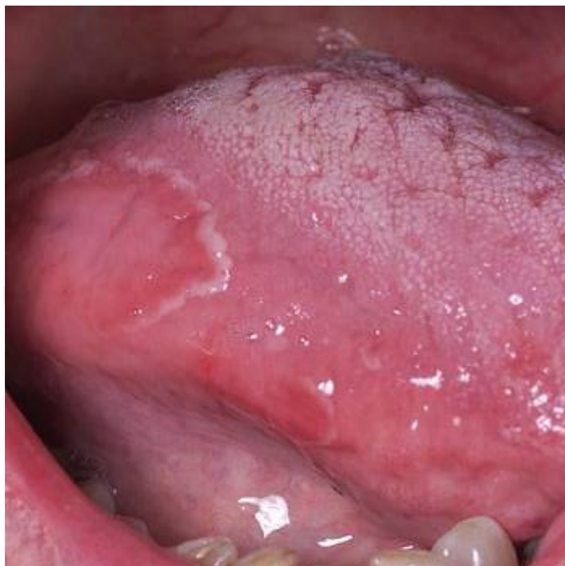
Figure 4. Geographic tongue