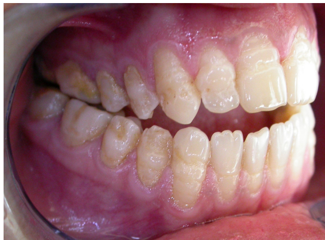
Figure 2. Hypoplasia and open bite in a female patient on hemodialysis

Most frequent orofacial signs of renal osteodystrophy are bone demineralization, lower trabeculation, lower density of the cortical bone, calcifications in soft tissues, radiolucent fibrocystic lesions, and complicated bone healing following extraction. Regarding the teeth and parodontal tissues we may observe delayed eruption, enamel hypoplasia (fig.2), loss of lamina dura, widening of the periodontal space, severe periodontal destruction, tooth mobility, denticles, obliteration of pulp chamber, and giant-cell lesions of the type "brown tumors"[78, 85].