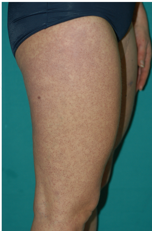
Figure 2. Maculae and follicular papules distributed on limbs in a patients treated with Vemurafenib