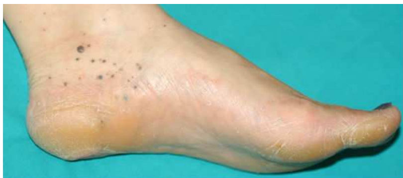
Figure 4. Plantar hyperkeratosis occurred in areas under physical pressure during Vemurafenib treatment

Topical keratolytic and emollient treatment can reduce hyperkeratosis, even if a complete resolution of this side effect was observed only after Vemurafenib discontinuation.