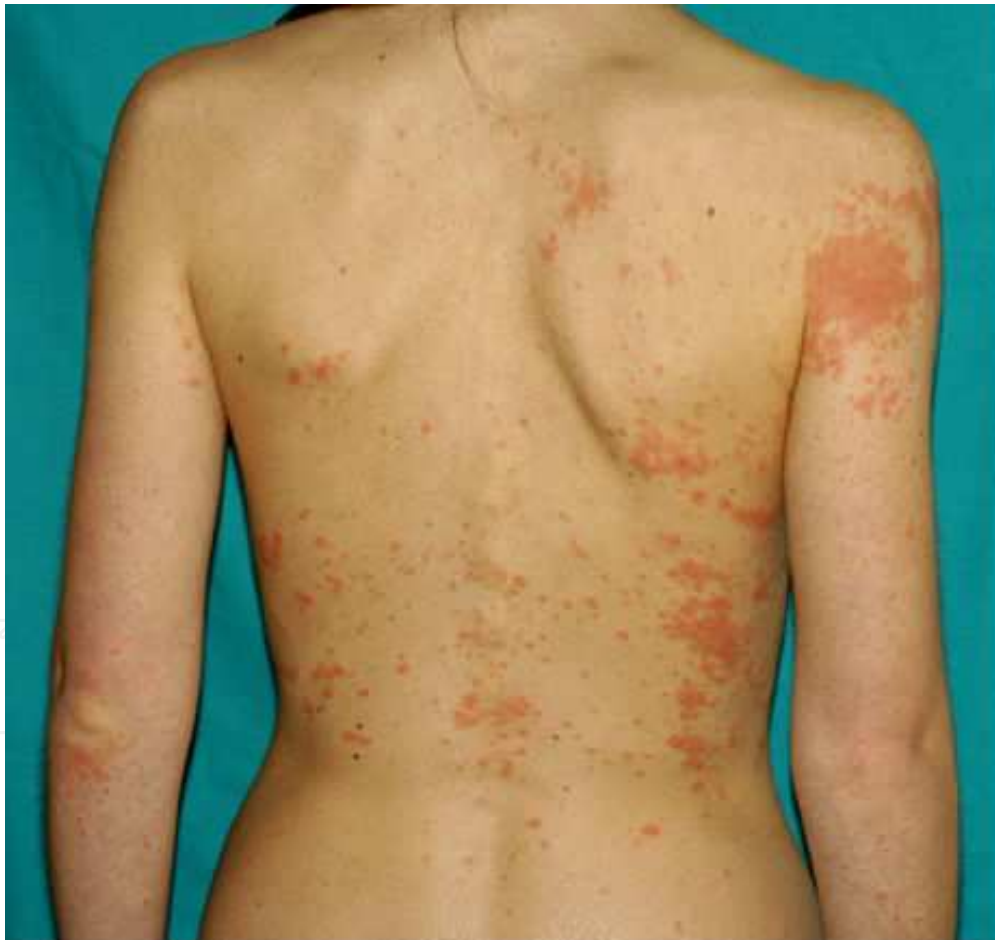
Figure 1. Erythematous-edematous rash in a patient treated with Ipilimumab

Even if Vemurafenib is generally a safe and well-tolerated drug, a wide spectrum of toxic effects has been described [14-18, 29, 30]. The most common one is represented by arthralgia, which occurs in about 60% of patients. Most cases are mild to moderate, but about 5% of patients treated with Vemurafenib experienced a grade 3 arthralgia [14, 29]. These latter cases can be managed conservatively with non-steroidal anti-inflammatory drugs and acetaminophen; however, severe cases may require a short course of steroid treatment [31]