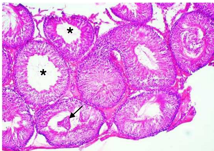
Figure 3. Representative histological section of testis from aminocarb-exposed rat (40 mg/kg/body weight) during 14 days. Immature germ cells (arrow) within the lumen of seminiferous tubules; some tubules (*) denoted a decrease on germ cell layers; haematoxylin-eosin stain. Original magnification: \times 100 .