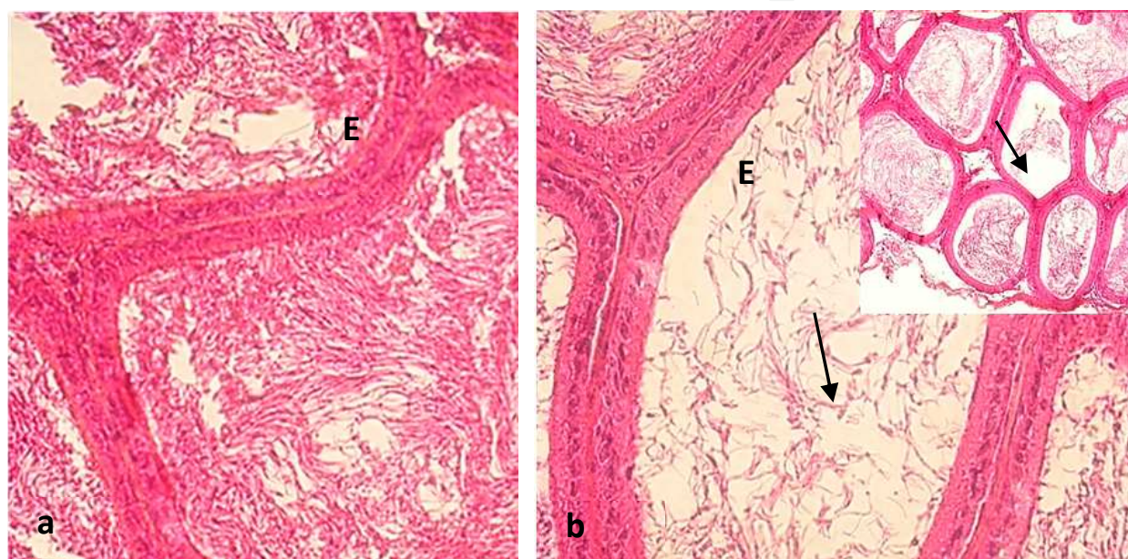
Figure 1. Histological sections of rat epididymis (E) from (a) control; and thiodicarb (40 mg/kg body weight) exposed animals during one month period (b). A considerable decrease on sperm is noted in the lumen (arrow); Inset – a general view displaying a reduction on sperm (arrow); haematoxylin and eosin stain. Original magnification: (a) x200; (b) x200; inset x40.

guidelines for ethics on animal experimentation using a similar protocol for epididymis (another reproductive organ). Briefly, three months old rats purchased from Harlan Iberica (Spain) were divided into two groups, and kept under appropriate conditions. Thiodicarb was dissolved in water and was given every day (40 mg/kg body weight) for a period of 30 days. For comparison, animals given water only were used. After one month, animals were anesthetized, and sacrificed for epididymis sampling and further histological analyses. No apparent macroscopic changes were noted in organs of thiodicarb-exposed rats. However the observations at light microscope level evidenced a reduction of sperm mass within the lumen (Figure 1). However no changes were noted on the epithelium lining the ducts.