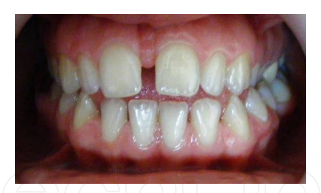
Figure 3. Open bite in a 19 years patient-thin periodontium predisposed at gingival recessions

According to Macht and Zubery [45], in this syndrome we are witnessing a significant increase in the gingival inflammation, consequence of the enhancing virulence of the dehydrated plaque (due to lack of labial competence), and an increase in the length of the clinical crowns of incisors, which may suggest that open bite predisposes patients to the development of gingival retractions localized in the incisor segment (Figure 3).