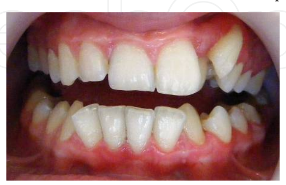
Figure 1. Gingival inflammation with papillae hypertrophy in lower and upper incisors, thin periodontium at 23 (eruption in buccal position) in a patient with dental crowding

They are a risk factor for the presence of septic inflammation, because due to the disparity between mesial-distal sizes of permanent teeth and corresponding alveolar arches' perimeter, various dental malposition occur, localized mainly in incisor-canine region (Figure 1), which causes retention of food debris and plaque, and difficulty in removing them by self-cleaning or artificial cleaning [38]. This correlation is weaker in the maxilla compared to the mandible [39].