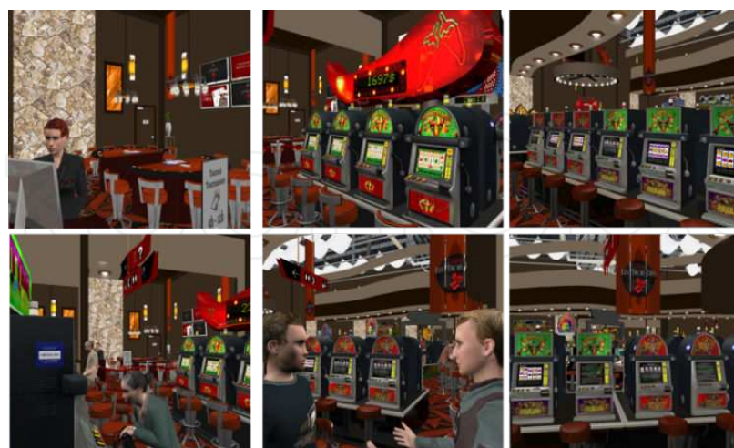
Figure 2. Screenshots of the virtual casino Les 3Dés / The 3Dices

A hierarchy has been constructed in the virtual bar to guide interventions, with users progressively approaching the machines where they can gamble (see steps 1 to 7 on Figure 3) and,