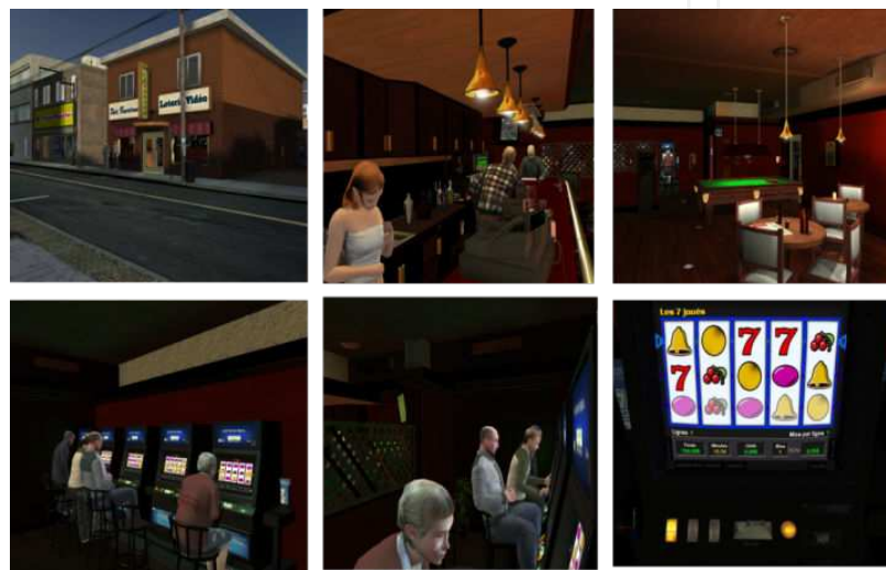
Figure 1. Screenshots of the virtual bar Chez Fortune / At Fortune

The virtual bar (named Chez Fortune / At Fortunes ) and the virtual casino (named Les 3Dés / The 3Dices ) were created at the Cyberpsychology Lab of UQO with the intention of simulating a gambling situation without the use of real money (see Figure 1 and 2). Any resemblance with real locations and these fictive locations is fortuitous.