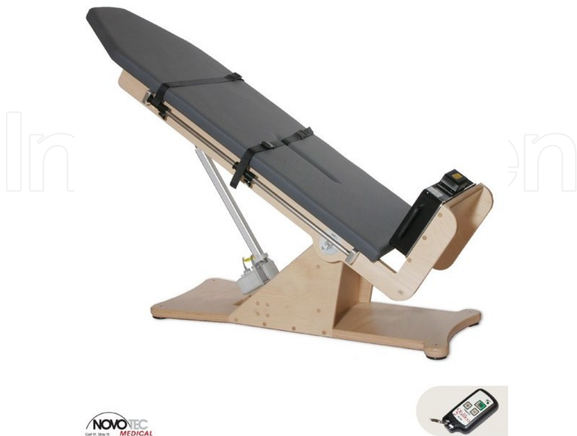
Figure 4. The Galileo Delta A TiltTable offers a wide variety of applications from relaxation to muscle training for a diverse range of patients who are unable to stand without support. The motor driven adjustable tilt angle of the Galileo Delta TiltTable (90°) allows vibration training with reduced body weight from 0 to 100%. This is ideal for deconditioned and disabled patients for gradually increasing training weights up to full body weight. System for application in adults (max. body height: 1.90 m) and children (max. body height: 1.50 m). The Galileo Delta A TiltTable is exclusively available from the manufacturer Novotec Medical GmbH. (published with permission).