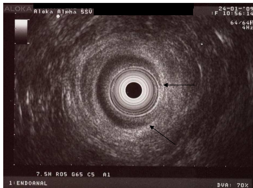
Figure 1. Endoanal ultrasound scan showing a defect in the IAS of a 57year old lady with passive faecal incontinence following haemorrhoidectomy. The defect is present between the arrows from the 3 to the 5 o'clock positions.

The main indication was IAS dysfunction or disruption. Unlike the EAS, the IAS is not amenable to surgical repair.