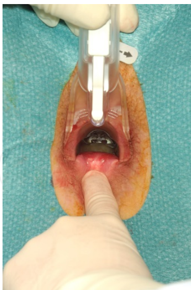
Figure 5. Palpating the IAS and the intersphincteric groove at the 6 o'clock position with a THD surgery Mini-light proctoscope in position.

A 2mm incision is made in the perianal skin, 2 cm from the anal verge (Figure 6).