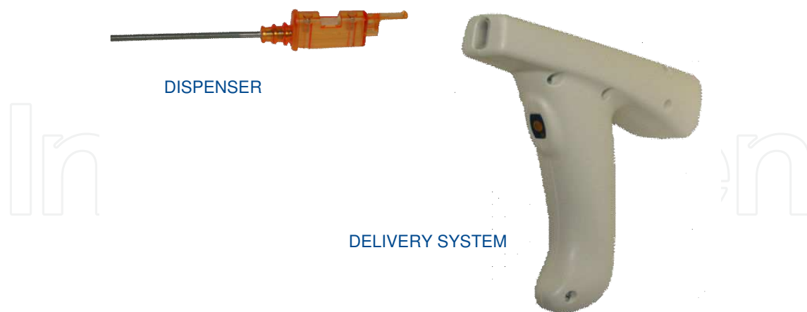
Figure 3. The Gatekeeper gun, made of the dispenser that houses one prosthesis, and the delivery system.