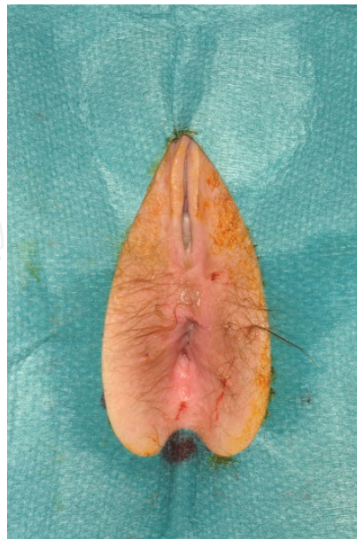
Figure 8. Six equidistant circumferential perianal wounds each closed with an absorbable suture (Monocryl 3/0).