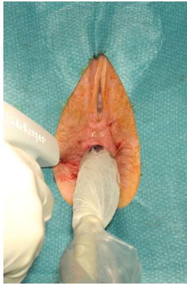
Figure 7. THD Gatekeeper needle at the 9 o'clock position, with the endoanal ultrasound probe in place to determine correct placement.

The steps may be repeated to insert between four to six prostheses, equidistant from each other. The choice of inserting 4 as opposed to 6 prostheses is arbitrary. The wounds are closed with a single absorbable suture (Figure 8). At the end of procedure, EAUS imaging will show the location of all prostheses.