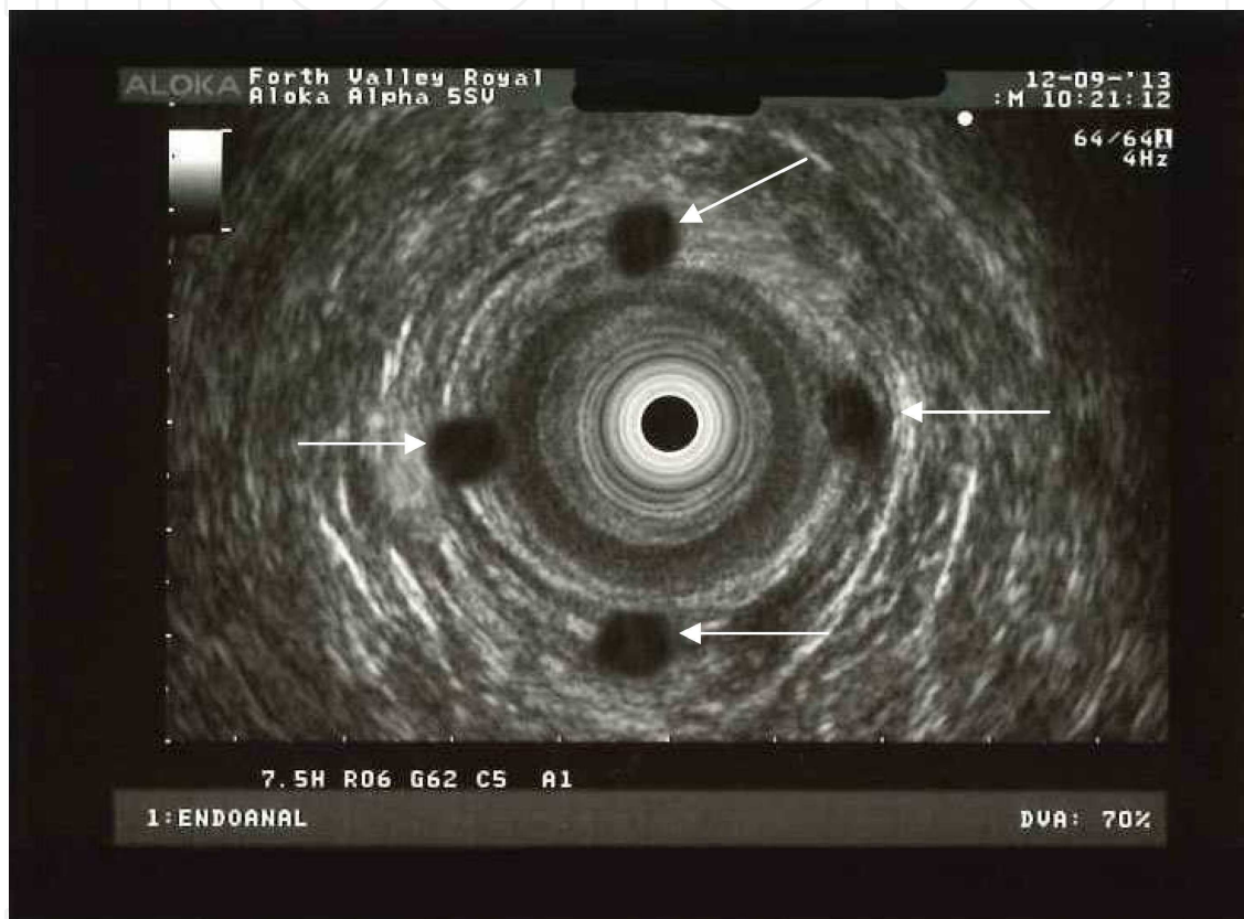
Figure 9. Endoanal ultrasound scan at 6 weeks following the implantation of four Gatekeeper prostheses (arrows) in a 72 year old male with idiopathic passive faecal incontinence.

The material remains identifiable both by palpation and by endoanal ultrasonography in the postoperative period (Figure 9).