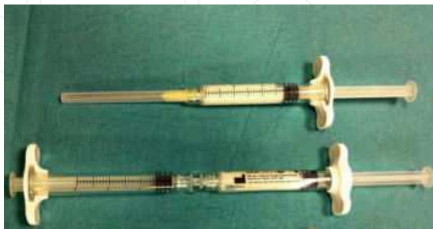
Figure 2. Porcine dermal collagen (Permacol) in a 2.5ml syringe

The bulking agent may be injected freehand, with an anal retractor such as Eisenhammer used to identify the IAS and intersphincteric groove. A finger placed within the anal canal may be useful to guide the needle to its correct position. However endoanal ultrasound has been recommended to guide the needle to an optimum position [13], especially if the agent is to be injected into the intersphincteric space or adjacent to a defect in the IAS.