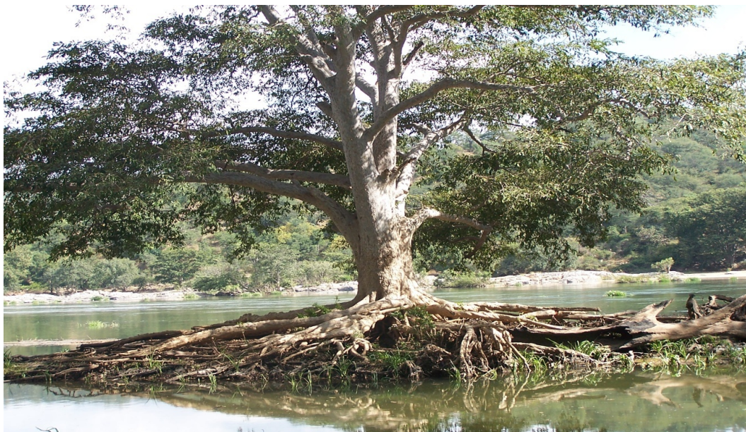
Figure 3. Species Terminalia arjuna growing along the banks of River Cauvery

as to provide a competitive advantage for adventitive forbs and grasses with higher nutrient requirements than their native counter parts.