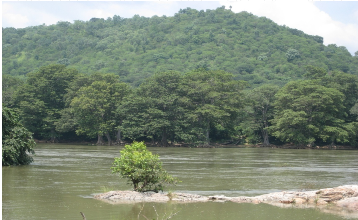
Figure 1. Overview of Riparian forest in the banks of river Cauvery

between these systems (Risser 1990). Riparian vegetation plays an important role in the maintenance of stream and foreshore stability. Streams and rivers are essentially dynamic systems, their path and flow constantly changes with the time (Warner 1983). The presence of vegetation in riparian areas acts to reduce the rate of change and therefore maintain a level of stability.