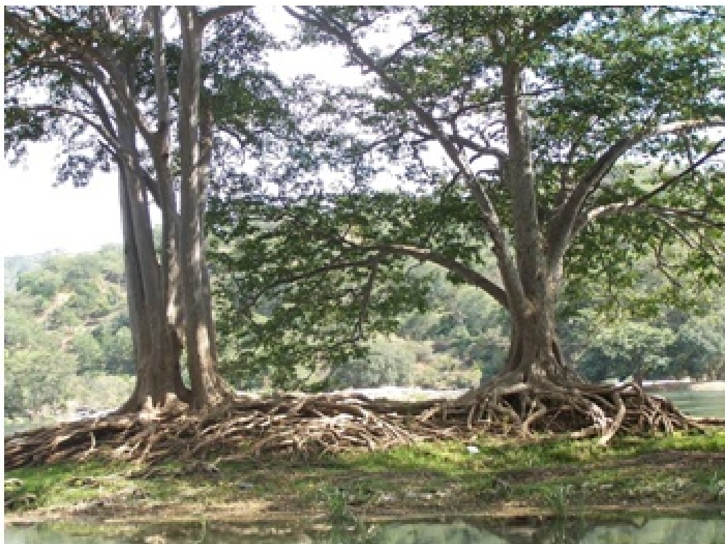
Figure 4. Species T. arjuna with its interlocking root system

as to provide a competitive advantage for adventitive forbs and grasses with higher nutrient requirements than their native counter parts.