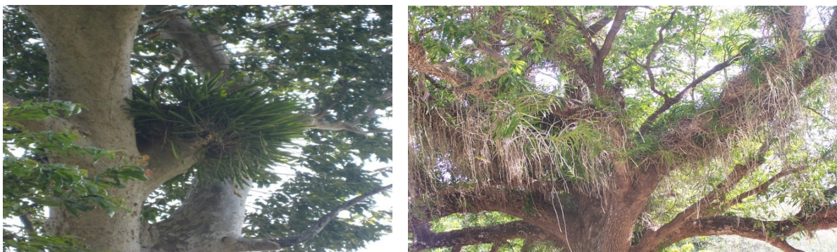
Figure 2. Epiphyte Acampe praemorsa growing on forks of tree species Terminalia arjuna and Orchids laden on tree branches of Madhuca latifolia .

The riparian plant species improves the microclimatic condition thereby allowing the other associated species to grow in the community. The forks of old trees in the riparian zone provide vantage points to epiphytes.