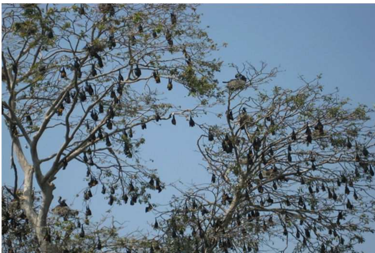
Figure 5. T. arjuna acting as the roosting sites for the bats during the day time