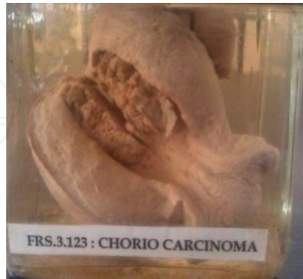
Figure 5. Specimen of choriocarcinoma of the uterus