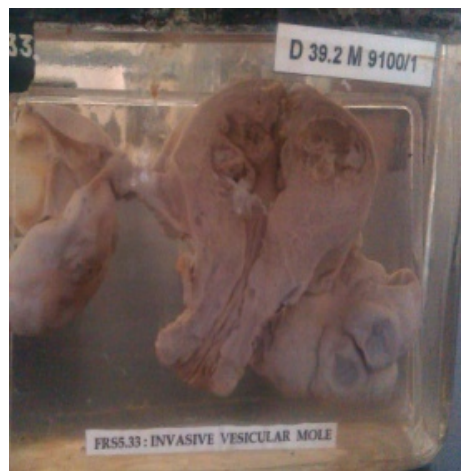
Figure 4. Specimen of an invasive mole

The villus structure is maintained as in hydatidiform mole but the uterine wall may be perforated in multiple areas (fig 4). Distant metastasis can occur via blood stream to lungs, vagina or brain. The treatment is hysterectomy followed by cytotoxic therapy [6].