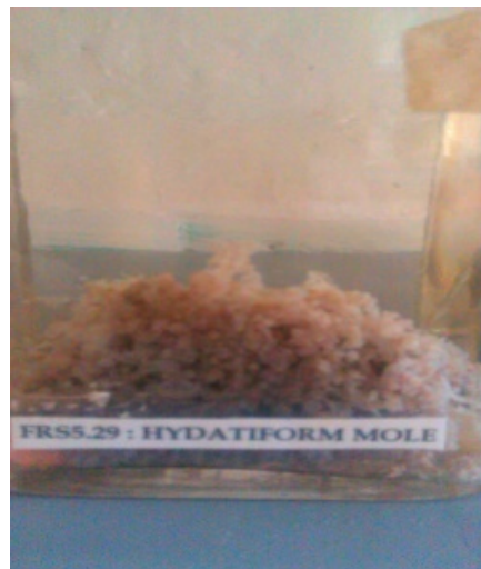
Figure 1. Gross appearance of hydatidiform mole

The mass in the uterus is made of multiple chains and clusters of cysts of varying sizes from a pin head to that of a large grape. The embryo and amniotic sac may or may not be seen. Red areas may be seen suggesting haemorrhage in the decidual space [6] (fig 1)