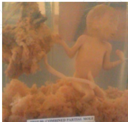
Figure 2. Specimen of partial mole.

Partial moles have triploid karyotype of both maternal and paternal origin. Partial molar pregnancies account for 10% of all hydatidiform moles [1]. In partial mole, there will be some identifiable foetal tissue (fig 2). Sanchez-Ferrer ML et al have described an extremely rare case of a partial hydatidiform mole with a normal fetus [21]. The classic clinical presentation described for complete mole is rare in partial mole and significant hCG level elevation is less common [15]. Ultrasonography will not show the classical snow-storm appearance (fig 3). Most often the diagnosis is made upon histological review of curettage specimens [15].