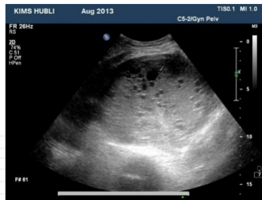
Figure 3. Transabdominal ultrasonogram showing 'snowstorm' appearance of a complete mole in the uterus.