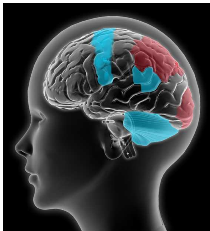
Figure 3. Schematization of brain activations during visual and kinaesthetic imagery. During kinaesthetic imagery (blue), the pattern of activity involves motor-related regions mainly, including cM1, PMC, SMA, cerebellum and basal ganglia (hidden from the view), as well as in the inferior parietal cortex. In contrast, more activity is observed during visual imagery (red) in occipital regions and superior parietal lobule, including the precuneus.

activations during visual imagery and kinaesthetic imagery of complex hand movements. Visual imagery activated predominantly the visual pathways including the occipital regions and the precuneus, whereas the pattern of kinaesthetic imagery involved mainly motor-associated structures and the inferior parietal lobule (Figure 3). These data support the hypothesis that visual imagery of a motor sequence refers to the visual properties of visual perception, while kinaesthetic imagery includes in greater extent motor simulation processes related to the form and timing of actual movements (Michelon et al. 2006). Although visual and kinaesthetic imagery shared common brain structures, these data provide strong evidence that the patterns of neural activity mediating the ability to perform a specific MI type are partially different. Practically, it might suggest that participants are able to favor one sensory modality to form mental images, although MI is a multimodal and multidimensional construct.