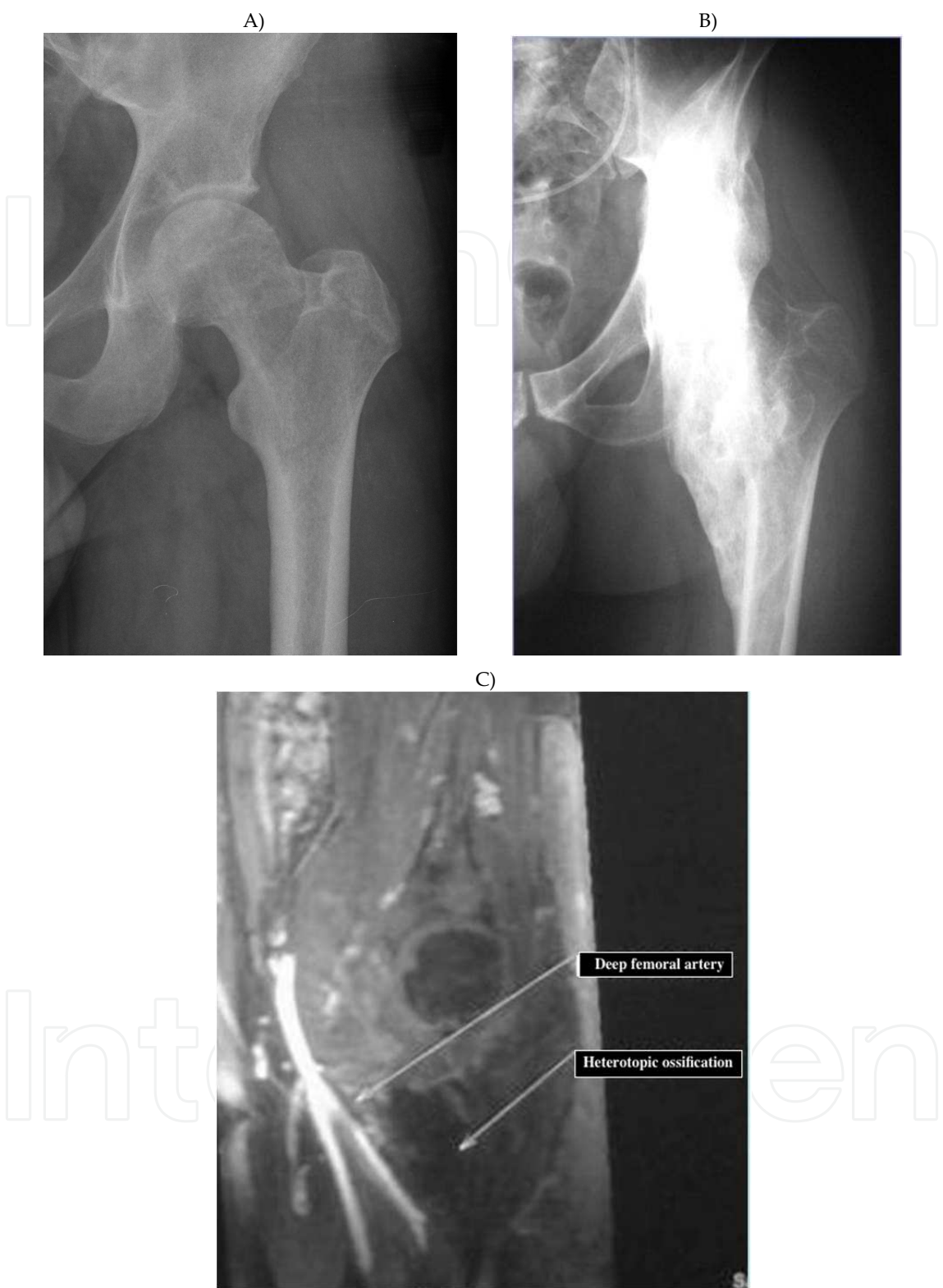
Figure 1. Neurogenic ossification in the hip in a patient after a traumatic brain injury. A) Radiograph of the left hip six months after the brain injury. B) Radiograph showing an anteromedial ossification around the hip causing severe ankylosis, 14 months after the initial injury. C) MRI enhanced with contrast showing a close relationship between the ossification and the deep femoral artery.