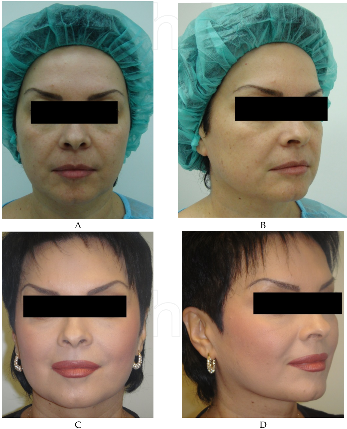
Figure 1. Patient N. 49 years old. Photo (A;B.) Before threads plantation. Photo (C;D.) Here is a correction of the middle third and lower third of the face. 1 month later.

Patients with atonic, rugulose skin with manifestations of photoaging can also improve their appearance using this method. L.L. Elegance works perfectly in combination with hyaluronic acid fillers, peelings, and botulinum toxin.