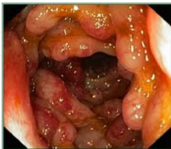
Figure 3. Mantle type of primary non-Hodgkin lymphoma

More than two-thirds of intestinal lymphomas are supposed to be of B cell lineage, while T cell intestinal lymphomas are rather infrequent and often multifocal and most frequently localized in the small bowel. In relation to the histological type of B cell, non-Hodgkin lymphomas can be: diffuse B cell type, MALT lymphoma, mantle type, Burkitt type and follicular lymphoma. The incidence of some histopathological forms differs from study to study, so Anderson and his associates presented the data of the, so-called, International Study Group about Lymphomas, which included 1378 patients from 8 different cities from 4 continents. Out of the total number of the histopathological findings, in 80% of cases B-cell lymphoma was diagnosed, where the most common form was the one with the large cells, while the other forms, such as mantle, Burkitt and MALT types were significantly rare. In relation to the histological grades, in 75% of tumors, a moderate and intermediately type of diffuse lymphoma of the large cells was established [24-27].