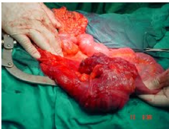
Figure 2. Primary non-Hodgkin lymphoma of the cecum

Lymphomas of colon and rectum are the rare tumors that make 1,4% of human lymphomas, 10-20% of gastrointestinal lymphomas, 0,2-0,6% of all malignant tumors of colon, that is, 0,1-1% of all tumors of the large bowel. According to the incidence in the gastrointestinal system in adults, they take a third place, following the stomach and small intestine, unlike with the age of up to seventeen, where the intestinal localization is predominant. In relation to the incidence of all malignant colon and rectum diseases, they take a third place, following adenocarcinoma and carcinoids [17,18]. The predilection places of occurrence are cecum and rectum, due to large amount of lymph tissue in these regions of the large bowel.