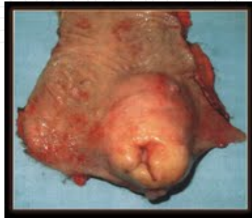
Figure 4. Rectal GIST

aims of sphincter saving procedure and improve the patient's quality of life. With regard to the size and localization of the large bowel stromal tumors, it is possible to use various surgical procedures: segmental resection, local excision, anterior and abdominoperineal resection. The performance of the anterior resection (high or low), means the observance of the partial or total mesorectal excision principles, in order to prevent sacral nerves injury, bleeding or local recurrence.