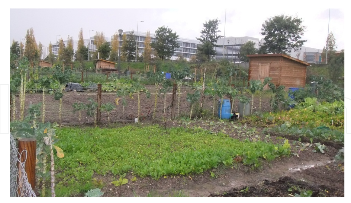
Figure 9. Allotment gardens on Quinta da Granja

In this context and in order to assure and increased the chances of success, farming in urban spaces requires: