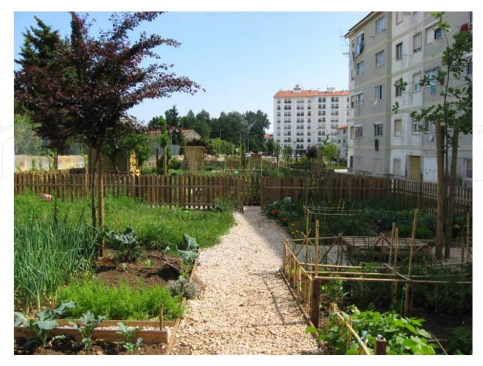
Figure 10. Organic allotment gardens on Cascais

Once accepted, urban farming will become sustainable and adapt to the ever-changing urban conditions, and to its demands, strengthening its productivity and diversifying its roles in the city, while reducing the associated health and environmental hazards. This is the way to win political and social acceptance. In certain parts of the city, the typologies of the existing farming practices can fade away or drastically change their methods and actions, while new methods may develop in other parts of that same city (Figure 10).