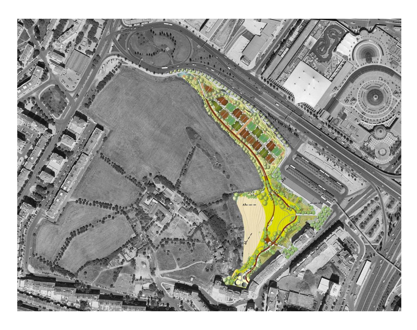
Figure 3. Figure 3 - Landscape design masterplan for Quinta da Granja