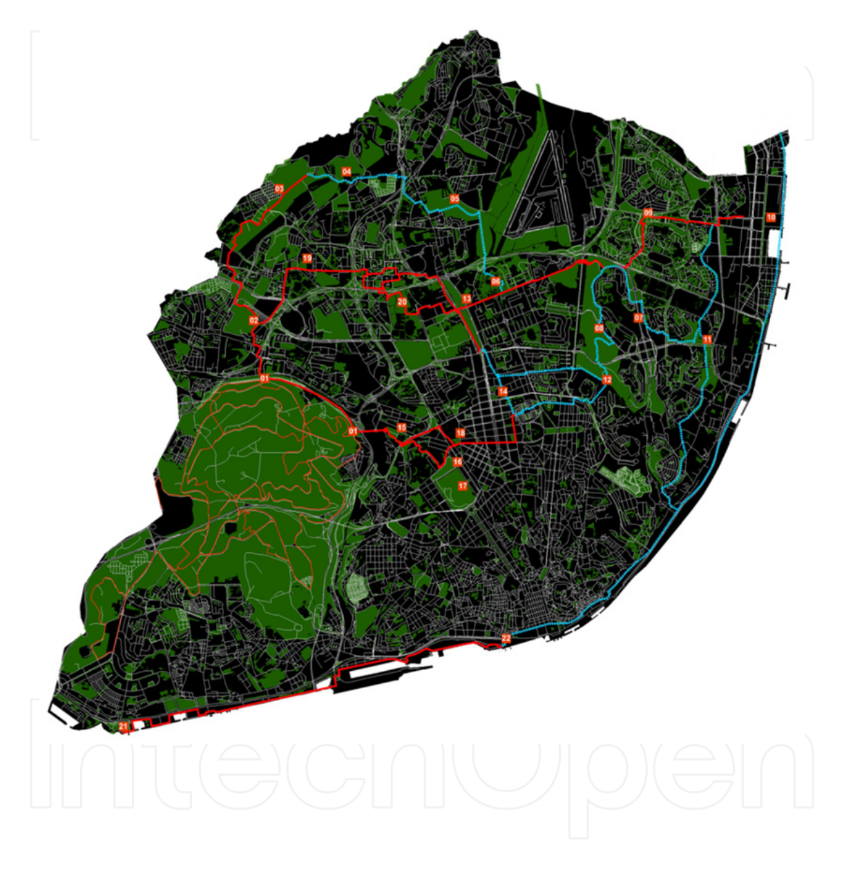
Figure 2. Lisbon's Green Plan – Articulation between pathways and open spaces

This plan makes it possible to obtain a continual landscape in which the productive aspect is strongly considered with the inclusion of existing urban vegetable fields and suggested farming parks, namely Quinta da Granja (Figure 3 and 4) and the Parque Hortícola de Chelas (Figure 5 and 6). This productive side is articulated with recreation and circulation, in a structure of open spaces extending all over the city.