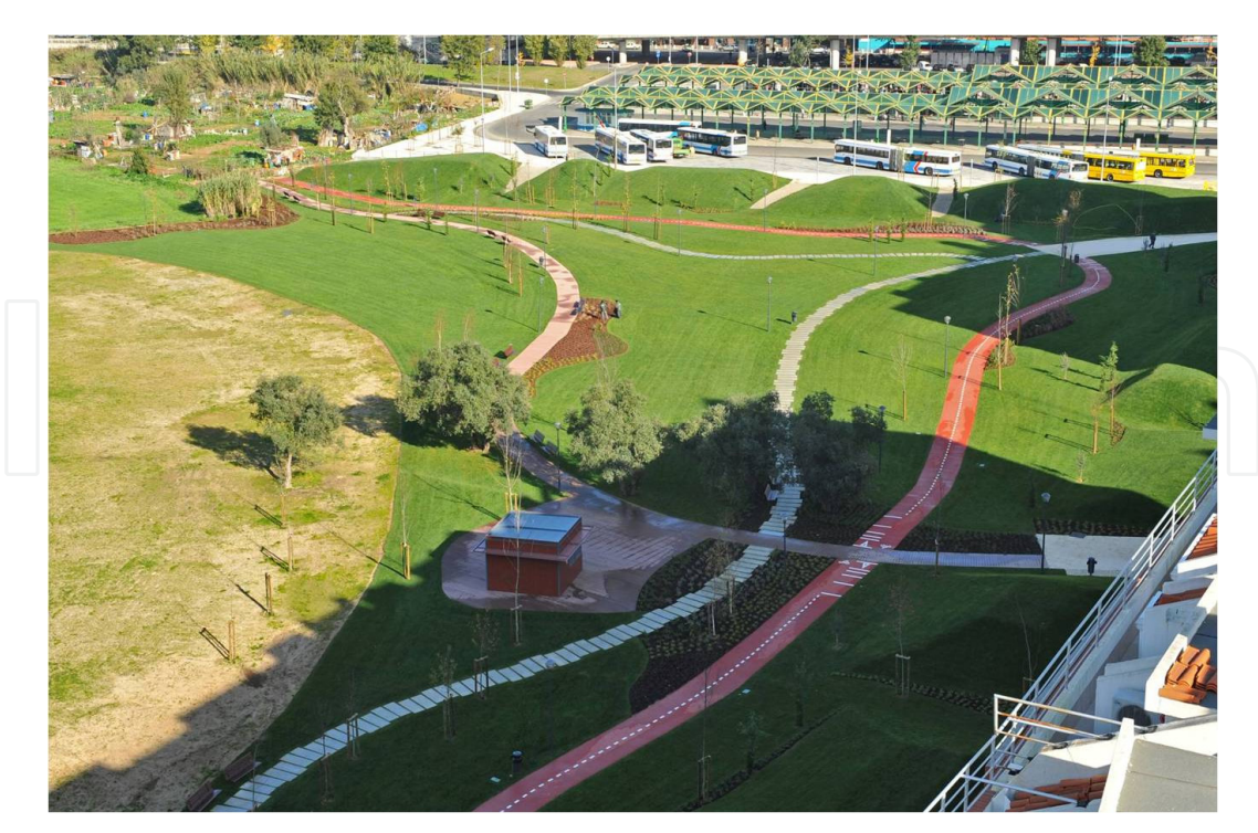
Figure 7. Pathways on Quinta da Granja

Each walk among cultures accentuates the experience of seasonality and intensifies the notion of time, due to the density of space where nature is experienced. Time is intensified — more nature for its time.