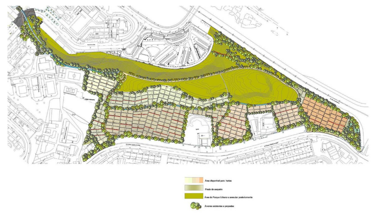
Figure 5. Landscape design masterplan for Horticultural Park of Chelas