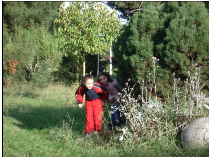
Figure 14. Figure 14. Plants are ideal materials to hide behind

(Moore, 2002). In addition, care must be taken for children's health and safety according to selected species (allergens, toxic, barbed should not be used).