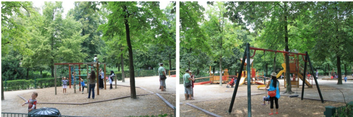
Figure 17. Figure 17. Play space from Brussels, Belgium

This area was designed in woodland in the city. It is particularly suitable for disabled people with ramp play equipment. It provides an opportunity to contact with nature for children as it is in a woodland area (figure 17).