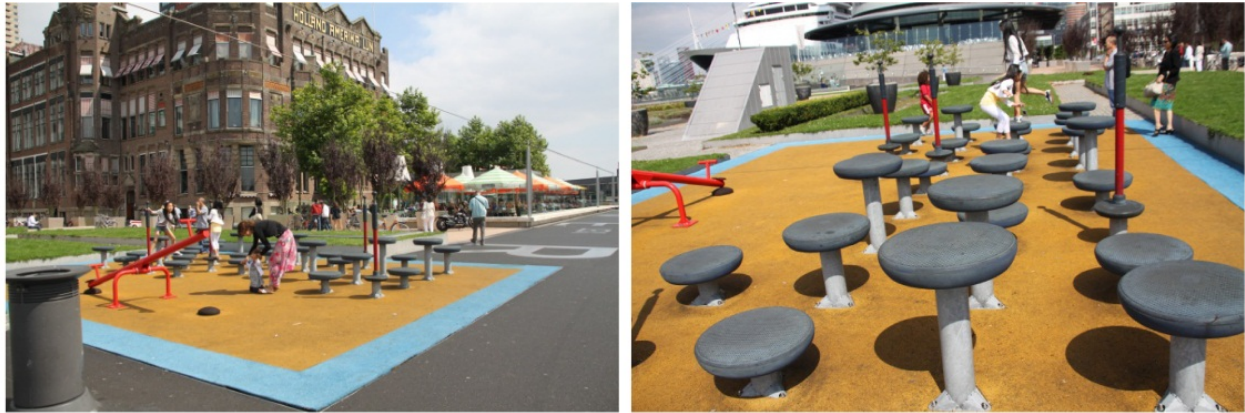
Figure 16. Play space from Rotterdam, Netherland