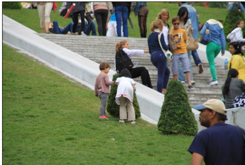
Figure 13. Plants are interesting materials for children

Children would like to see plants that can be used for play. For this purpose, plants can also be used to serve a variety of outdoor activities in open spaces designed for children. Trees, shrubs, flowers, vegetables and parts of these plants, such as branches, leaves, pinecones are important elements of children's environments and plays (figure 13, 14, 15). Plants in child environments are used with the objectives of enclosure, identity, movement, climbing, play props, programmed activities/education, accessibility/integration, landmarks, seasonal change, wildlife enhancement, climate modification, and environmental quality (Moore, 2002). Plants offer different color options in different seasons with their colorful leaves, flowers and fruits. Results of the author's master thesis that focused on the plant preferences for children play spaces revealed that children like red, yellow, mottled, blue and orange colored leafs while they do not like yellow and green colored leafs. Study also revealed that purple, pink and white flowers were favorite, while red and white colors were unfavourable. In terms of fruit color, study also found that red and blue were favorite, while yellow and orange colors were unfavourable (Acar, 2003).