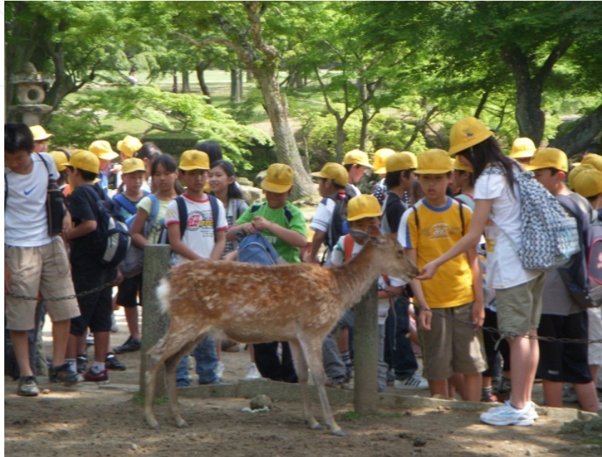
Figure 12. Figure 12. The opportunity of interaction with animals allows children to have information about the animals (Photo Acar, H., Nara, Japan)

Girls are often pay attention to the aesthetics of the environment and like colorful and beautiful flowers. Girls particularly 13-15 aged ones, have a variety of definition about the space when compared to boys (Day and Midbjer, 2007). It is observed, that girls prefer, for example, flowers and butterflies and trees, whereas boys prefer more active play such as sliding and playing hide and seek. However, they all need quite places to rest, talk, and socialize (Simonic et al., 2005).