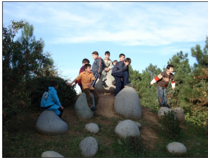
Figure 8. Figure 8. A rock garden and rocks in the garden designed aesthetically for adults are elements seating, climbing, over and around the watch for children