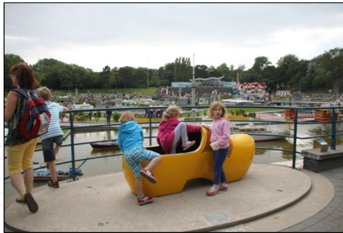
Figure 2. Any object that children can enter might be a play space for them (Photo Acar, H., Den Haag, Netherland).