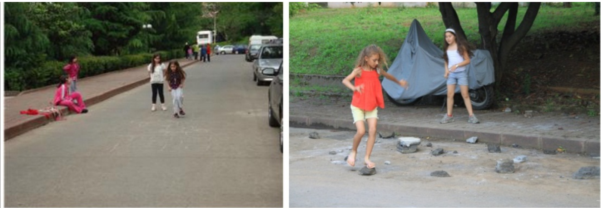
Figure 10. Figure 10. Streets are play spaces for children near their home

both sexes and all age groups. However, streets are thought as a transportation routes used to go from a point to b point or parking areas for vehicles by adults (Moore, 1991).