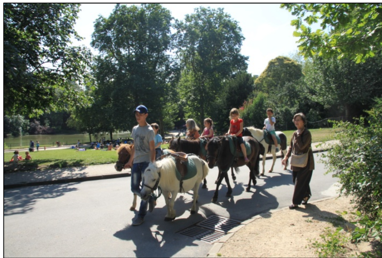
Figure 7. An activity allowing direct contact with nature- pony ride on the area-

"Study nature, love nature, stay close to nature. It will never fail you" Frank Lloyd Wright (Tai et al., 2006). This expression of Wright explicitly refers to the result of being in relationship with nature.