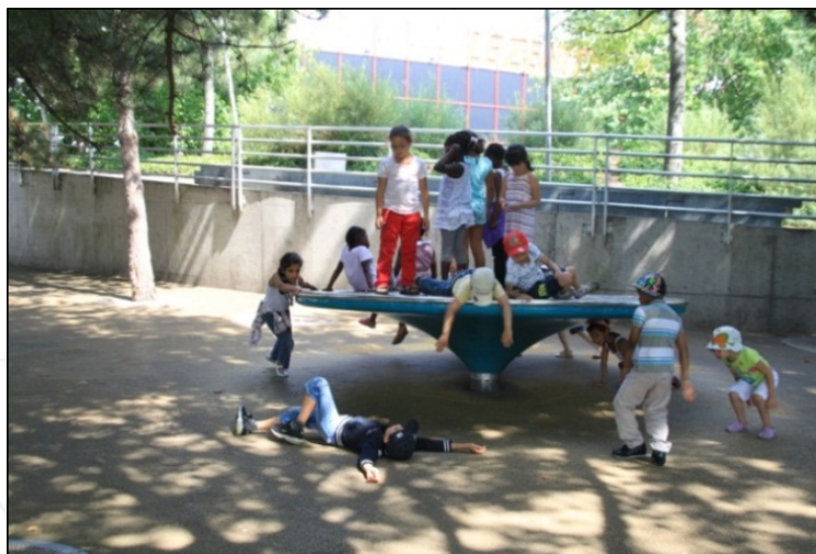
Figure 5. Open spaces provide the opportunity to be together with other children.

Open spaces provide more opportunity than the closed spaces with the materials they have (Heerwagen and Orians, 2002; Day and Midbjer, 2007; Acar, 2009). First of all, these spaces experimentally allow children to contact with their environment, to make observation and to learn natural events (change of the seasons and so on). Also, it helps children to become social because it presents the opportunity of being together with other children (figure 5, 6).