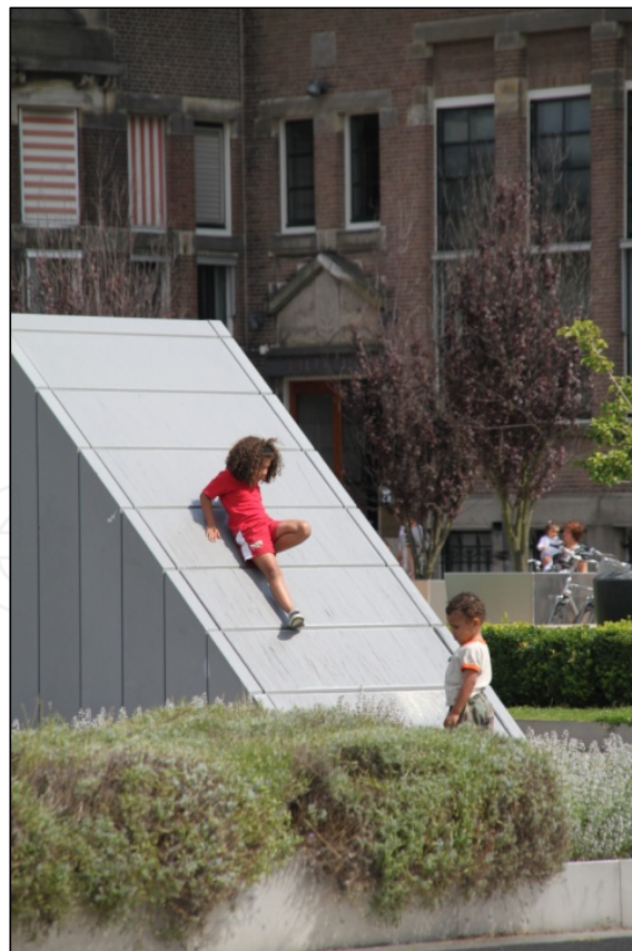
Figure 1. Sloping surfaces in any area are used to slide by children.