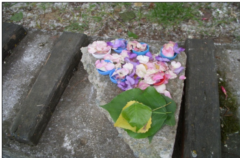
Figure 15. Figure 15. Plant parts are important play materials

Finally, White and Stoecklin (1998), cited the following features that children likes to see in public areas;