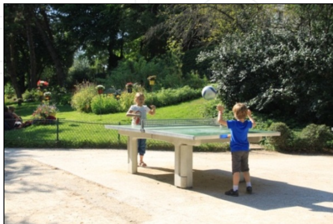
Figure 4. Children use materials in the environments according to their own purposes (Photo Acar, H., Paris, France).

Children use these opportunities according to their own imagination, creativity, or purposes (figure 4).