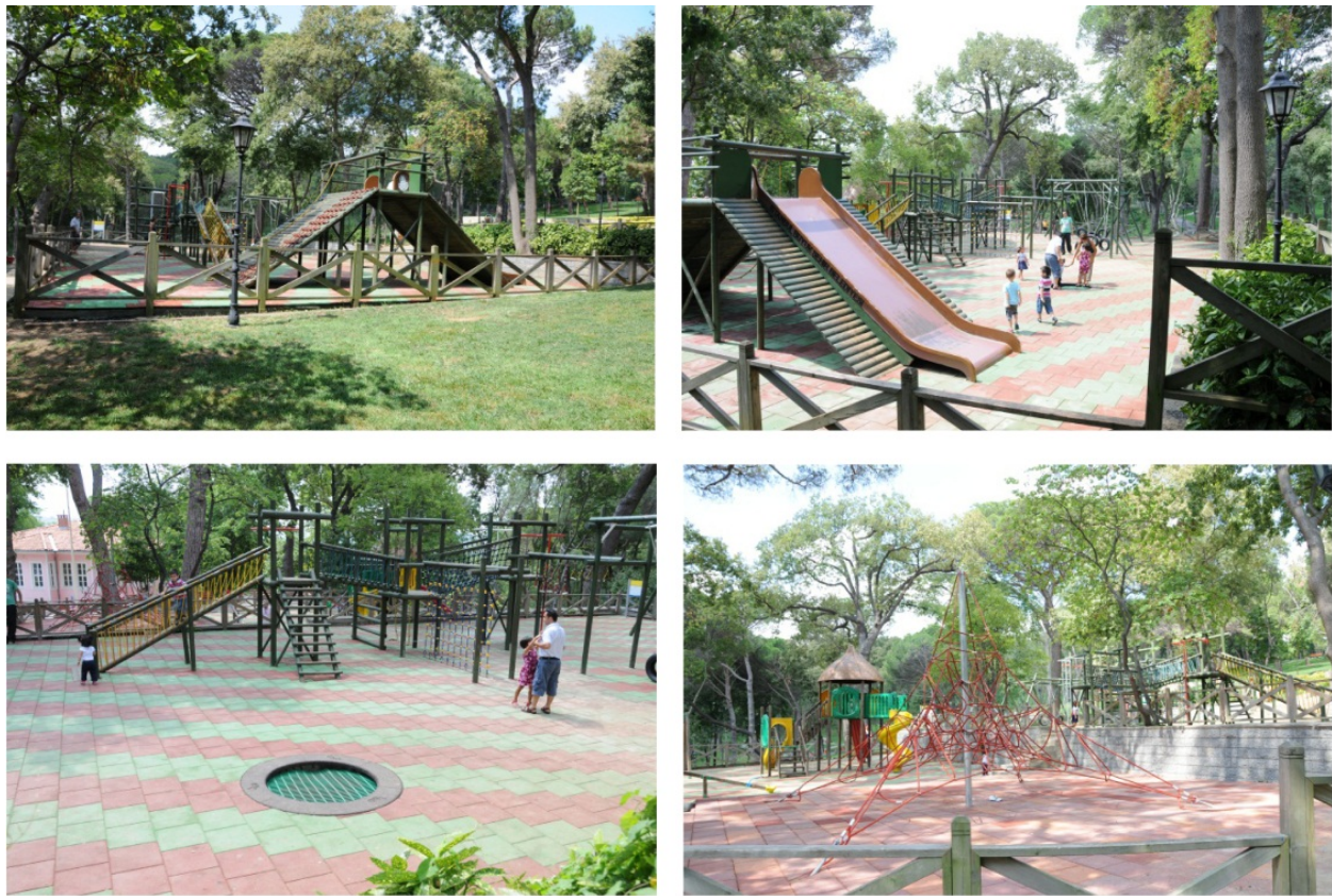
Figure 21. Play space from Istanbul, Turkey