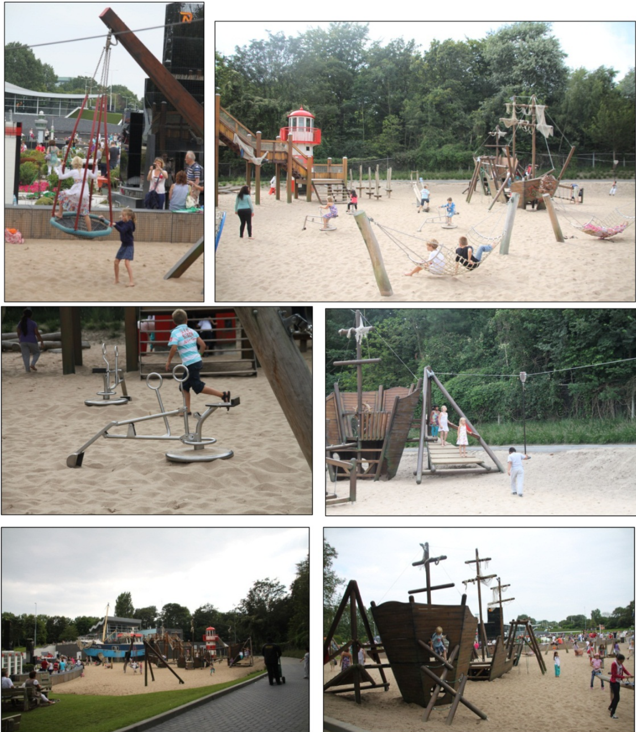
Figure 20. Play space from Den Haag, Netherland