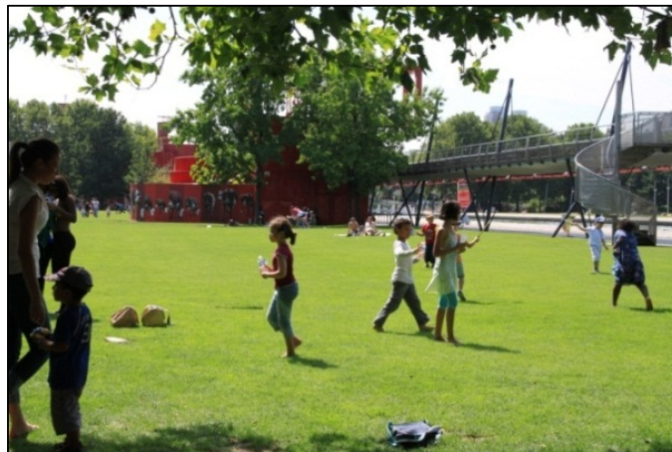
Figure 3. Open green spaces provide opportunities for different activities.

Children use these opportunities according to their own imagination, creativity, or purposes (figure 4).