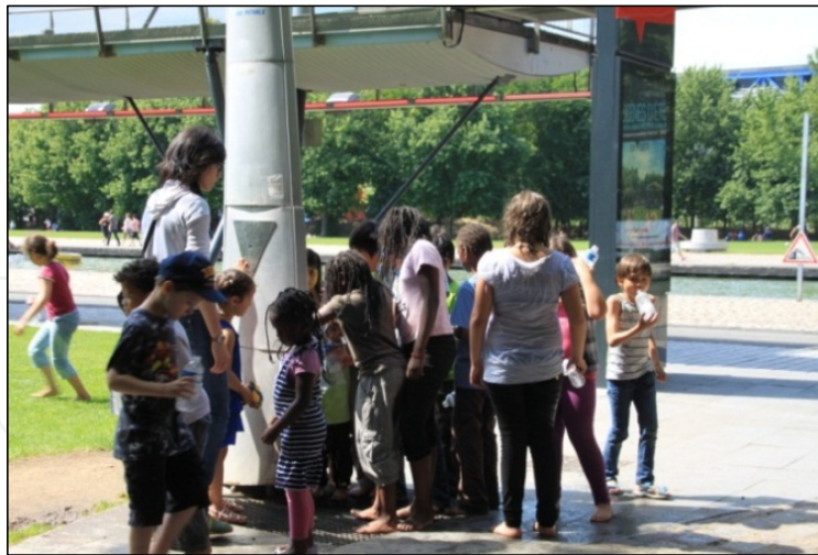
Figure 6. Even a fountain allows children come together, to communicate, to socialize. At the same time helps them to learn issues such as to respect the rights of others and their right to self-defense (Photo Acar, H., Paris, France).