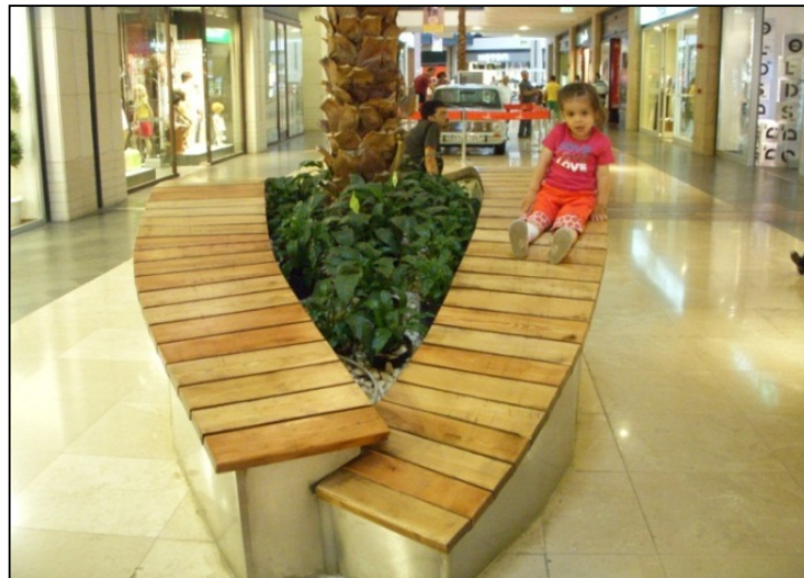
Figure 9. Figure 9. A curved equipment designed by adults for aesthetically or sitting in the shopping center can be play element to slide for a child

For example, while adults enjoy looking at a lake, trees, the grass, these must be a tactile auditory, oral and olfactory experience for children. “It is through body contact, direct and often disorderly, that need to experience their world”. Puddles of water that adults avoid are funny places splashing when pressed for children. Lush green hills adults likes looking at is a place to roll down, feel the wet soft grass, smell its green smell for a child, an experience the free fall of tumbling round and round. Adults prefer visually clean and well maintained places instead of irregular and wet grass in open spaces. However, children as one of the players that use the environment are “place-messers” (Francis, M. 1997).