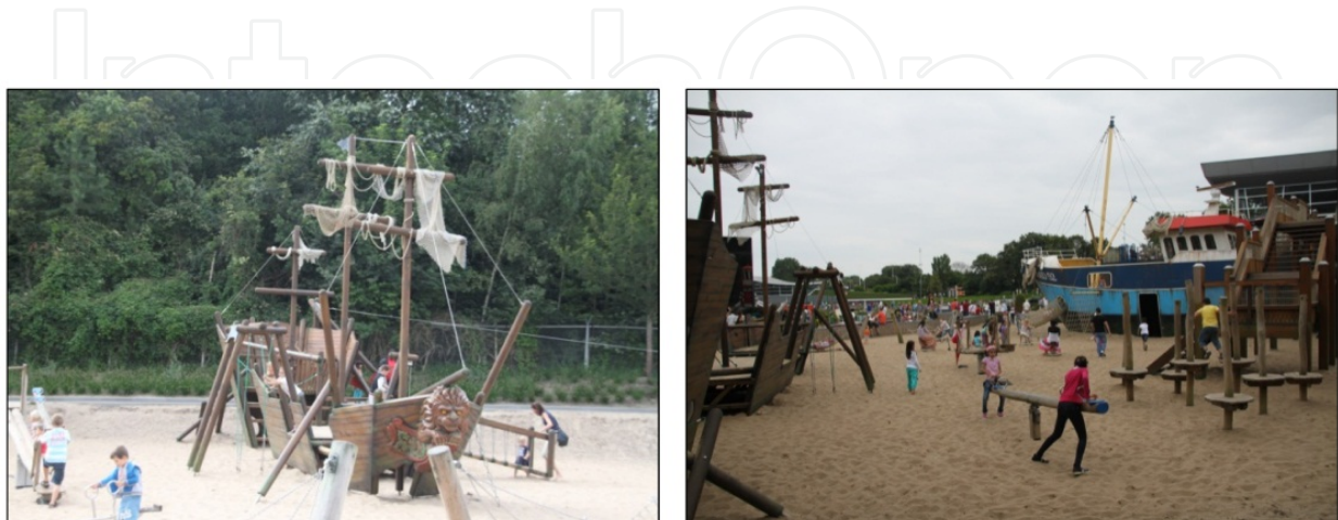
Figure 19. Figure 19. Play space from Den Haag, Netherland

There is also a ship figure in this play space. In addition, there are different equipment for different activities such as swinging, sliding, balancing, jumping, and playing with sand. Seating areas were also designed around the playground for parents together with the children (figure 19, 20).