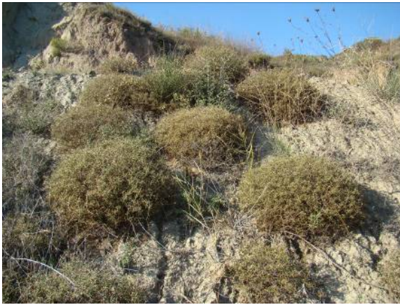
Figure 29. Sarcopoterium spinosum (L.) SPACH.