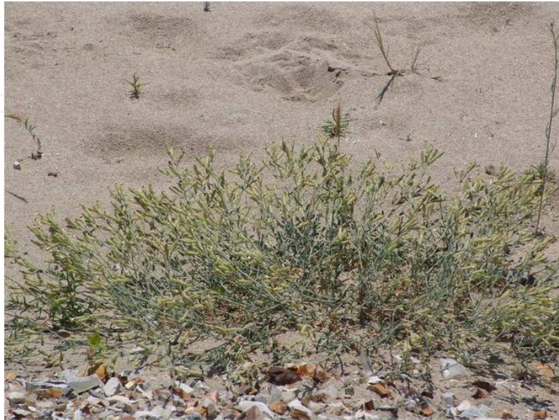
Figure 13. Silene sangaria Coode & Cullen (endemic)

north, north west, south of the south-westerly winds, the creation of different climates. Therefore, the vegetation varies in the vertical direction only, but also by looking also varies widely (Figure 14).