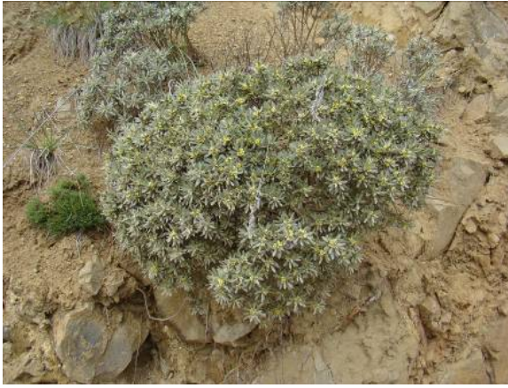
Figure 27. Thymelaea tartonraira L.