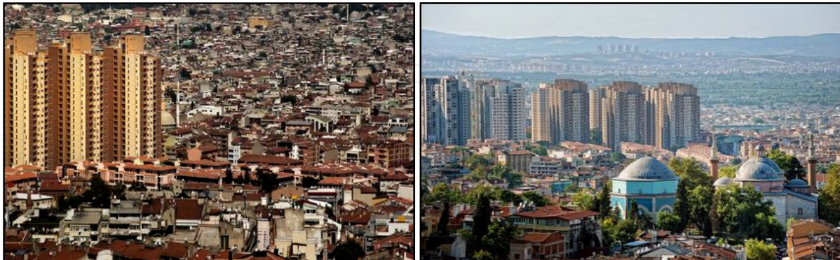
Figure 4. TOKİ housing projects in Bursa [41] (Left: 2 nd Prize Winner- Photo by Egemen Ergin, Right: Photo by Bülent Suberk).

“Ottoman” and “Seljuk” style architecture approaches in its projects will only be “characterless imitations” as long as TOKİ continues with projects which are unfamiliar with Anatolian culture in terms of site selection, organization of neighbourhoods, accommodation characteristics and social and cultural services.