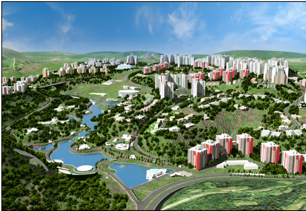
Figure 6. North Ankara urban transformation project [43].