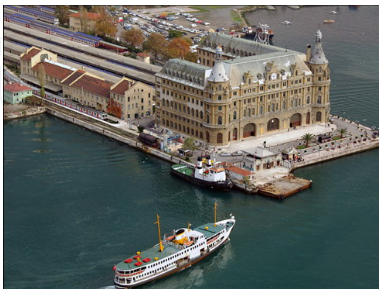
Figure 8. Haydarpaşa Train Station [47].

Both projects were approved this year by the Cultural and Natural Heritage Conservation Board, despite having stirred great public controversy. Istanbul Mayor Kadir Topbaş had previously said that the two areas, which have cultural and historical value, would be opened to tourism."