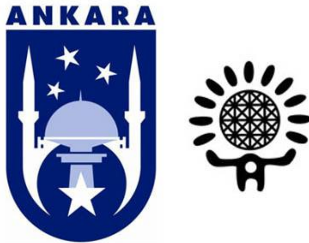
Figure 5. The current emblem of Ankara is on the left and the former is on the right [42].

tools for the municipalities for the last decade. However, similar to many other attempts on the built environment, these projects have always been controversial and have received serious criticism from academicians and professional organizations. This is mainly due to the fact that urban renewal or urban transformation projects in Turkey often ignores the social, economic and cultural dimensions and based on merely the physical transformation of the environment. The gecekondu s are replaced by TOKİ's apartment blocks, transforming the city into homogenized units as explained before. In Figure 6, the urban transformation project (by TOKİ) on North Ankara is presented. Such projects do not contribute to the social and cultural aspects of the city and moreover they are unsustainable and not in coherence with the Ankara's identity envisaged when the Republic was first established.