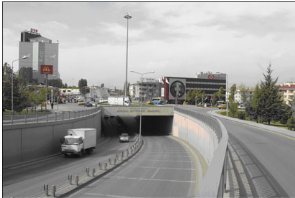
Figure 7. An underground road in Ankara [44].

Today there are more than 20 shopping malls in Ankara, which is the result of rapid growth of market economy globalization and liberalization processes. Besides the consumption based-culture they partially contributed to and supported, shopping malls have been one of the reasons of decline in use of public spaces in Ankara. Oguz and Çakıcı (2010) have found that people tend to prefer spending their leisure time in shopping malls rather than outdoor public spaces due to the services and facilities shopping malls offer [45]. However, public