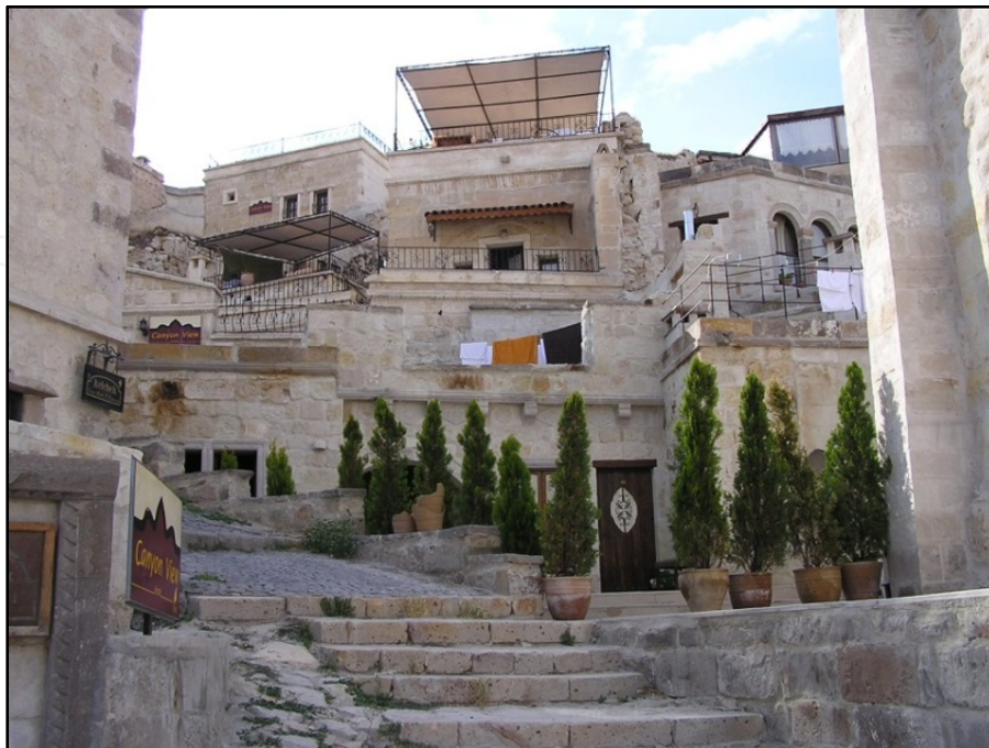
Figure 3. Local architectural identity in Göreme, Cappadocia region, Turkey.

The characteristics of landscapes in Turkey significantly vary between its regions. For instance while Black Sea region's landscape is characterized by the plateaus, meadows, tea farms/gardens and wooden houses, landscape in Aegean region of Turkey is dominated by olive trees, maquis and stone houses. Similarly, the settlements in different regions have