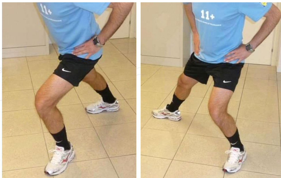
Figure 11. Lunges in all planes with return to start position. Increasing the length of the step and / or the execution speed of each sitting to vary the training stimulus.