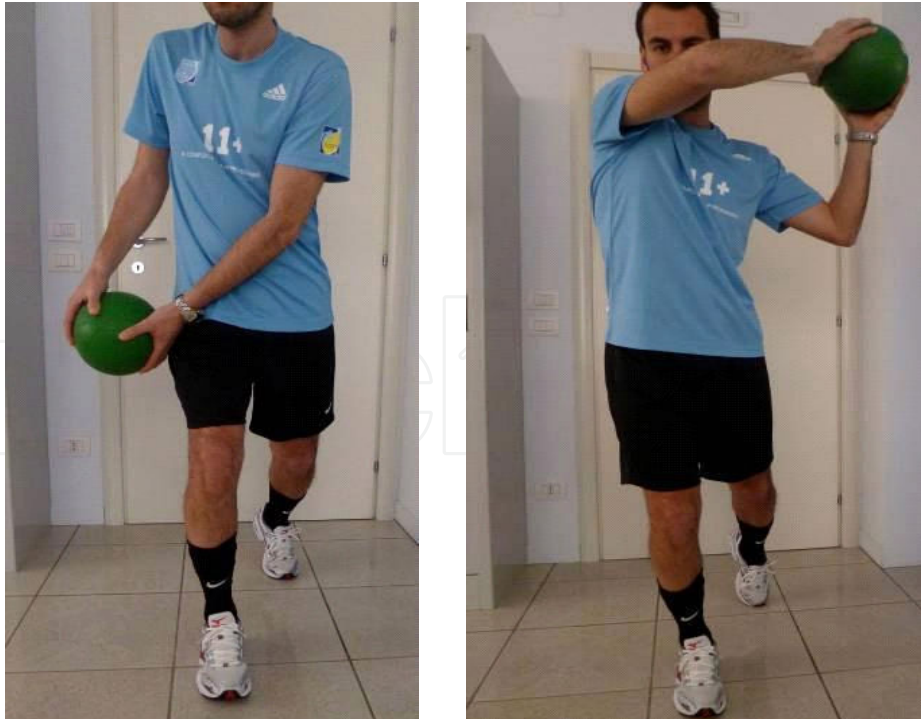
Figure 4. The patient should rotate the trunk as for kicking with the aim to train the core musculature.