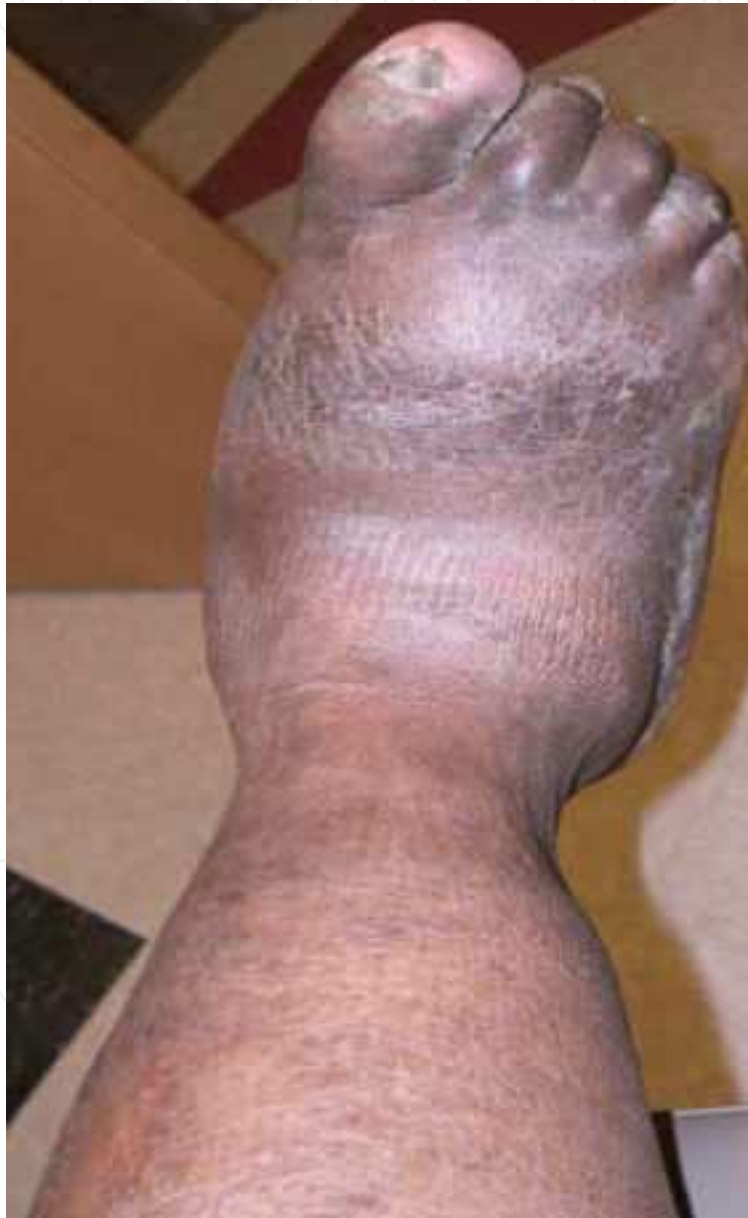
Figure 3. Neuro-osteoarthropathy of Charcot foot

symptoms, and disease activity. Similarly, (Pitocco et al., 2005) showed significant reduction in bone resorption markers with the use of another bisphosphonate alendronate and noted clinical improvements in the CN foot at 6 months. Some clinicians also prescribe bisphosphonates in the early stages of treatment, as the bone mineral density of the affected foot is low. Unfortunately, while these drugs can significantly reduce the levels of bone turnover markers, temperature, and pain, evidence of clinical benefit such as an earlier return to ambulation or radiographic improvement is weak at best.