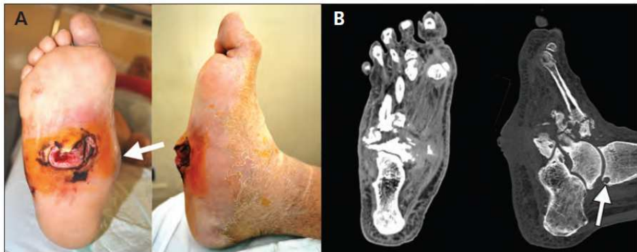
Figure 1. The right foot (plantar and lateral views) of a 59-year-old man with diabetic neuropathy showing collapse of the internal arch (arrow) and a large neuropathic ulcer on the midplantar surface. (B) Computed tomographic images (dorsoplantar and lateral views) of the patient's right foot showing a subchondral cyst (arrow), fragmentation, disorganization, and loss of normal architecture of the talus, calcaneus, tarsal bones and bases of the metatarsals. (Nicola Mumoli MD & Alberto Camaiti MD, 2012).