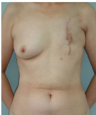
Figure 8. Pre-operation