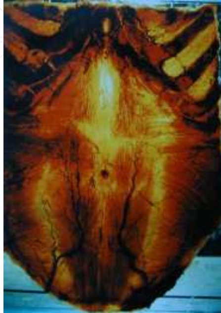
Figure 2. Transparent Morphology specimen of the Thoracoabdominal Wall

2) There were two accompanying veins found with communicating branches. No valve had been found inside the internal mammary vein, intercostal vein and communicating branches. The IMV retrogradely drained distally from two direct ways, via the communicating branches to the other IMV and then to the subclavian vein and via the intercostal vein to the posterior intercostal vein and then to the vena azygos [Fig.2].