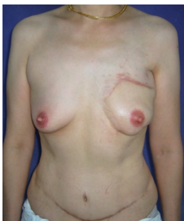
Figure 9. Post-operation