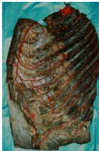
Figure 1. The anastomoses among DSEA,m.p.a. and i.c.a;

Results: 1) The IMA was found originating from the subclavian artery, then running along the sternum, and segmentally connecting to the intercostal arteries from the aorta. It was divided into two ends at the sixth intercostal space as the deep superior epigastric and musculophrenic arteries. The musculophrenic artery was found linked to the abdominal aorta by anastomosed with superior and inferior phrenic arteries. This is the anatomic basis of distal end of IMA as one recipient supply artery, which means that, if the IMA was cut off near the third intercostal space during the clinical procedure, the retrograde IMA flowed distally from the extensive anastomoses among the intercostal, musculophrenic and deep superior epigastric arteries.[Fig.1].