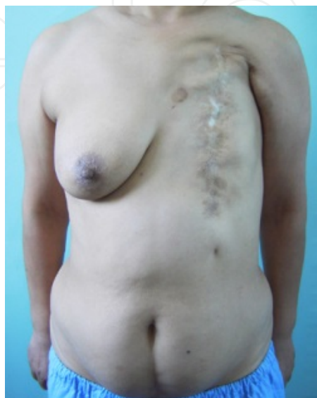
Figure 4. Pre-operation

ends of internal mammary vessels (proximal and distal) all by end-end was performed for left breast reconstruction. Upper and lateral part of the flap were de-epithelialised and placed under the local flap to recreate a natural looking chest wall and anterior axillary fold. Six months after the operation, nipple reconstruction with modified “arrow” flap was made. [Fig 4,5]