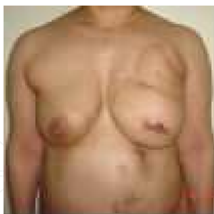
Figure 5. Post-operation

Typical case 4: A forty-two-year-old female, five years after the left modified radical mastectomy and radiation therapy. Her right breast was big, with abdominal wall not thick enough having a transverse Caesarean scar.