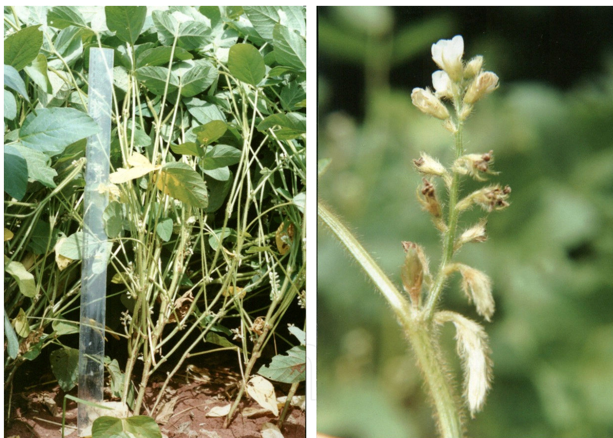
Figure 3. A transgenic soybean plant in flowering, and in zoom showing the abortion of the flowers.

The time of nectar and/or pollen collection was evaluated with a chronometer, having followed the honeybee forager in its activity. In addition, the time of permanence of the honeybee in the flower and the number of visits per minute were counted and recorded.