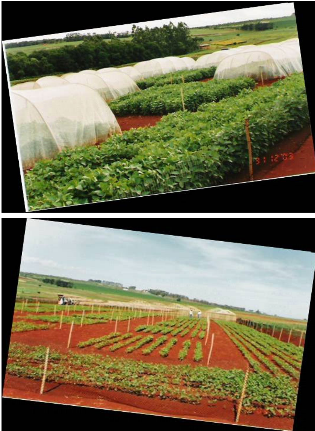
Figure 2. The soybean harvesting carried out separately line-by-line on the 18 parcels in the experimental area of Embrapa – Soja in Londrina-PR, Brazil.

the pollen grains removed from the honeybee forager corbicula was also verified using this same technique.