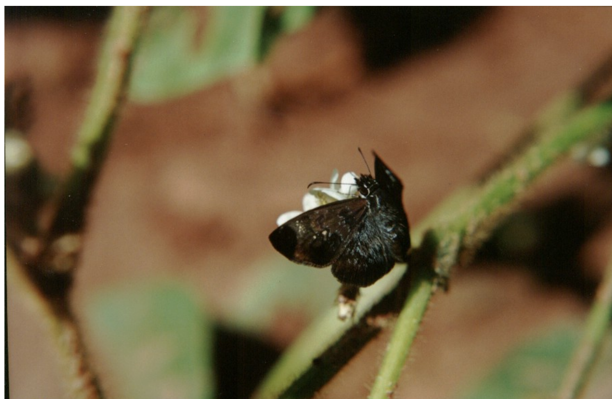
Figure 4. Lepidoptera in soybean flower

The average concentration of total sugar removed from the honey stomach (called crop) of the honeybees that collected nectar throughout the day was of 41.19\% \pm 3.72 , in pollination cages with honeybee colonies inside; this was greater ( P=0.0008 ) than the 38.22\% \pm 3.37 measured from the area of free insect visitation (Figure 7). In these two areas there were also a difference ( P=0.0001 ) between the collecting schedule.