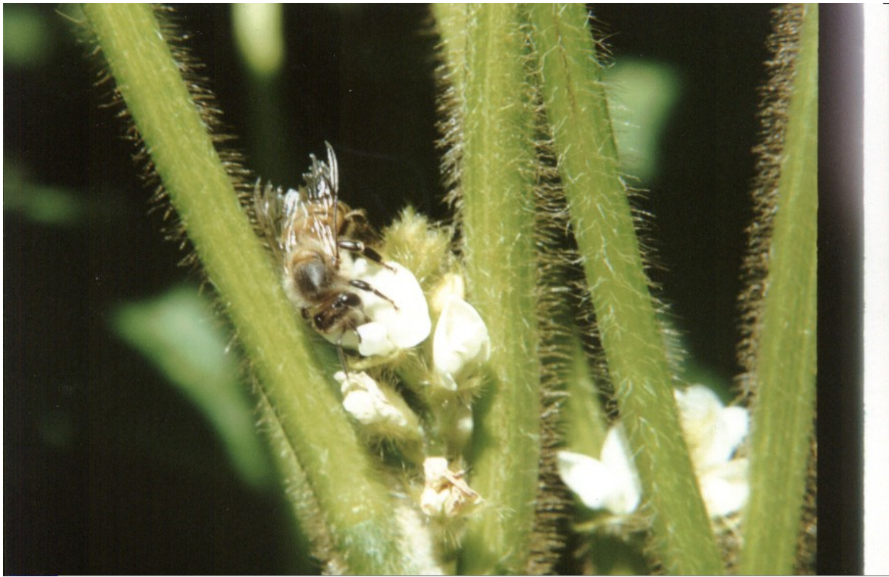
Figure 5. The honeybee searching a reward in soybean flower