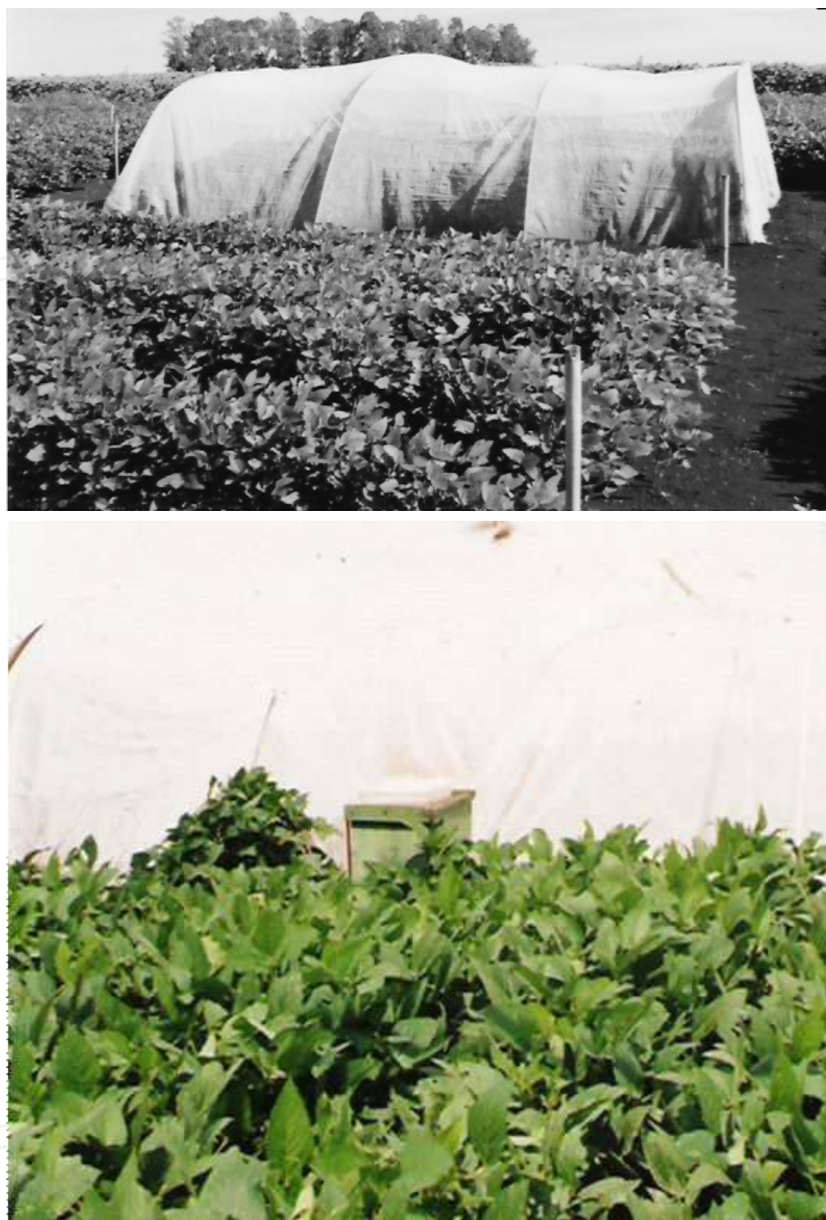
Figure 1. Pollination cage model used in the experiment with dimensions of 24 m 2 , below the Africanized honeybee colony inside the cage.

The stigma of each flower was separated and immersed in hydrogen peroxide (20 volumes) and the air bubbles detached observed and evaluated with scores that varied from zero for non-receptive, one for moderate receptivity and two for high receptivity [7, 40]. For the verification of pollen grain viability, withdrawal of the pollen grains was made from the same flowers used to evaluate receptivity; these were deposited in blades, stained with acetic carmine and stored for posterior analysis, following the technique of [16, 17]. The viability of