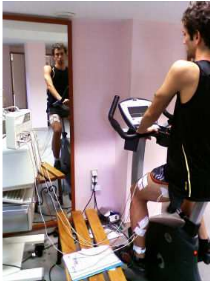
Figure 2. A research of lower extremity muscle groups [66] ( Photograph shot during a study by Sozen H. et al.).