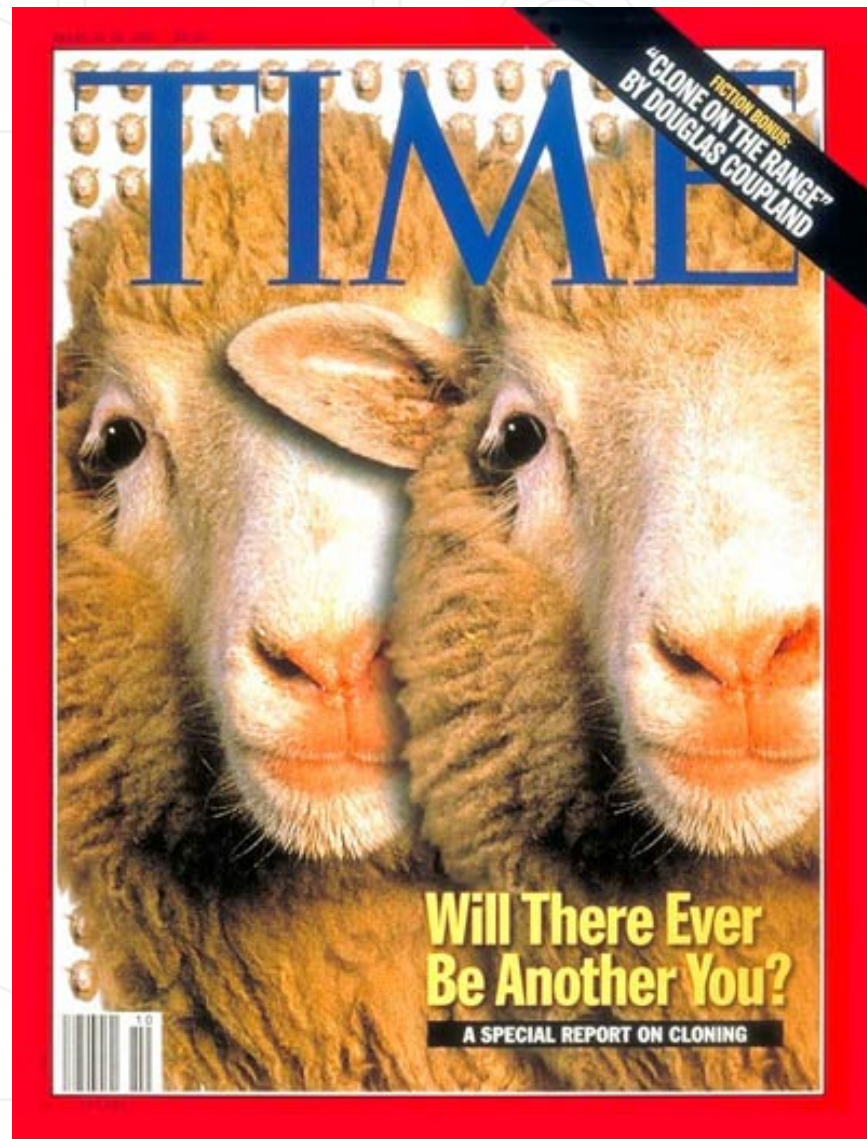
Figure 4. Cover of Time magazine (10 March 1997)

scenarios are presented as perverse and are morally assessed. These hypothetical examples find their way into the collective conscience, acquiring a certain dose of credibility [19]. Before such scenarios actually occur, people already have a more or less detailed idea of the motivations that others might have to resort to cloning. In order of appearance in the media, Hopkins has detected the following: