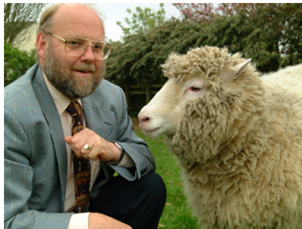
Figure 1. Professor Ian Wilmut and Dolly