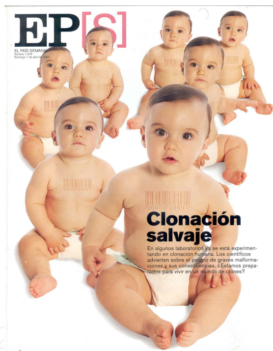
Figure 3. The photographic composition illustrating the report Clonación salvaje (Savage cloning) reinforces the "exact copy" myth, so frequent in popular representations of human cloning (Source: El País Semanal 1279, 1 April 2001).

One of the most alarming images that the mass media highlighted about cloning was the "loss of individuality". The idea that a cloned person is not a unique individual implies two very closely related assumptions [19]. The first is that however exact the copy (clone) is, it does not transcend its condition of "laboratory counterfeit". The spurious nature of the clone is identified with its illegal provenance. After announcing a five-year federal moratorium on human cloning, Bill Clinton, the then President of the United States, stated this perception very eloquently. 5 Indeed, a clone, as an illegitimate laboratory copy, is regarded as an unnatural entity, that is, artificial, and therefore its "production" is contrary to human dignity. The story in Time magazine, for instance, held that "Dolly does not merely take after her biological mother. She is a carbon copy, a laboratory counterfeit so exact that she is in essence her mother's identical twin" (10 March 1997, p. 62).