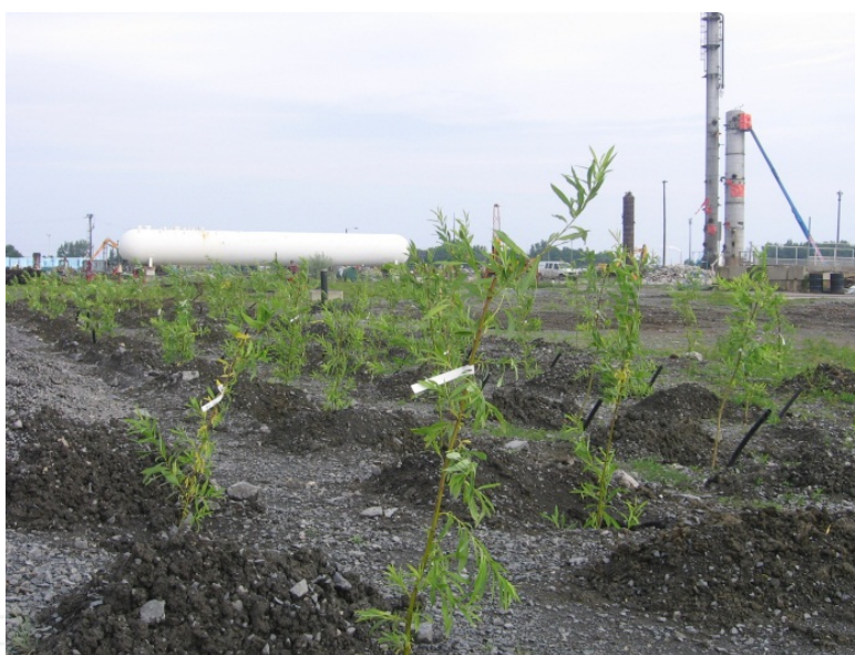
Figure 8. Phytoremediation using willows on a former oil refinery around Montreal

Phytoremediation using willows is becoming an increasingly popular alternative approach to decontamination, and several studies and pilot projects are underway. Willows have been used successfully to treat highly toxic organic contaminants such as PCBs, PAHs, and nitro-aromatic explosives [87]. Similarly, willows, in particular S. viminalis and S. miyabeana , have been shown to accumulate Cd and Zn in their stems and leaves while sequestering Cu, Cr, Ni and Pb in their roots [85,88,89,90]. In previous studies, the efficiency of willows in short-rotation intensive plantation for the elimination of heavy metals contained in wastewater sludge has been investigated [28, 59, 90]. We have also found that willow may be useful for improving sites polluted by mixed organic-inorganic pollution [91] (Figure 8).