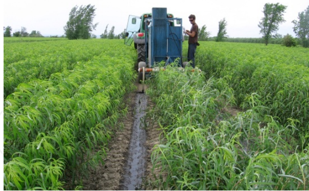
Figure 4. Pig slurry application to a willow plantation

production conditions. This means that even though nitrogen in slurry may be less efficient than that in a mineral fertilizer, a significant reduction in the production costs of willow-based biomass as well as recycling of a greater quantity of slurry can be achieved simultaneously [54].