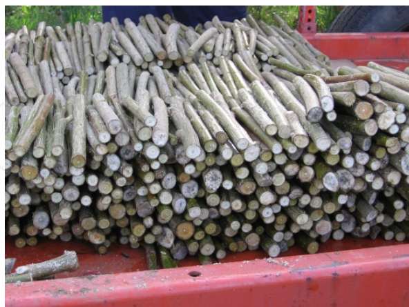
Figure 2. Willow cuttings before planting

wood) are selected to prepare cuttings. Tips of stems bearing flower buds are first discarded. Then the rest of the whip is cut into 20-25 cm lengths using an adapted rotary saw and stored in boxes, ready to be planted (Figure 2).