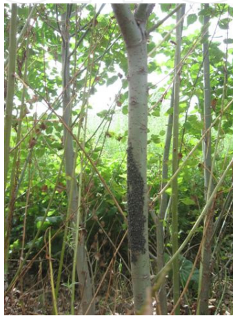
Figure 5. Giant aphids feeding on willow. This insect is often found forming large colonies at base of the stem.

stem surface of a willow tree. Laboratory experiments with willows grown in soil and in hydroponic culture have revealed that this species can reduce the above-ground yield of biomass willows, have severe negative effects on the roots and reduce the survival of both newly planted and established trees [63]. Other preliminary studies carried out in the UK have shown that this insect's feeding behavior is affected by chemical cues from the host. Researchers found that one of its most preferred willows was S. viminalis [64]. Although large colonies of this insect have recently been found on several willow varieties in Quebec, it is not yet possible to estimate its threat to willow plantations in this region (Figure 5).