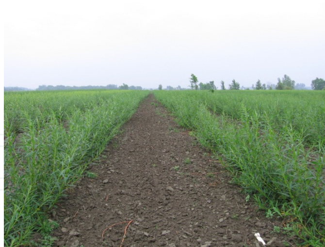
Figure 3. After cutback willows sprout vigorously from the stumps

There is much evidence that most newly-established willow plantations profit immensely from being cut back at the end of the first growing season (Figure 3).