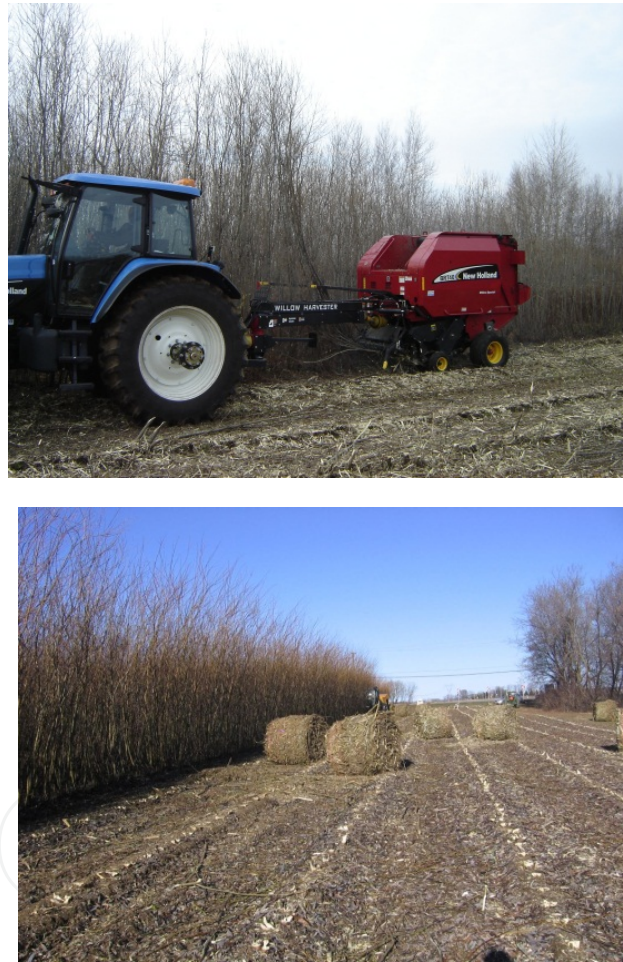
Figure 6. Willow cutter-shredder-baler harvester operating in Quebec

A third harvest system recently developed in Canada, mainly adapted to willow short-rotation coppice, is a cutter-shredder-baler machine that performs light shredding and bales willow stems [22], producing up to 40 bales \text{hr}^{-1} (20 t \text{hr}^{-1} ) on willow plantations (Figure 6).