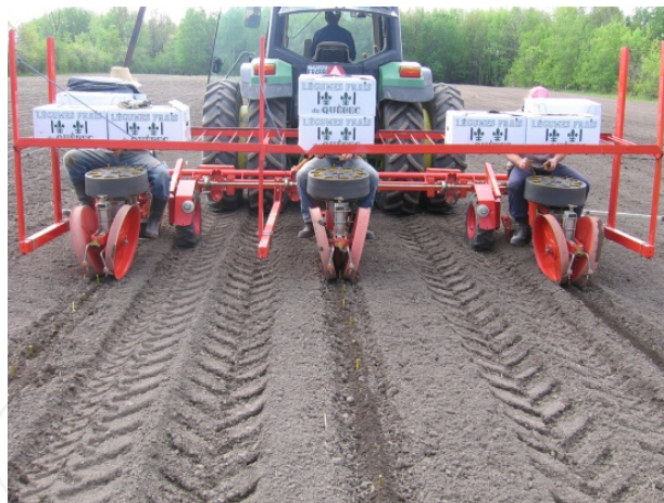
Figure 1. Willow planting machine operating on 3 rows simultaneously

Planting material consists of dormant willow stem sections, either rods or cuttings, depending on the planting machinery to be adopted. In some countries, for example in the UK and in the USA, 'step planters' are the most commonly used machines. Willow rods 1.5-2.5 m long are fed into the planter by two or more operators, depending on the number of rows being planted. The machine cuts the rods into 18-20 cm lengths, inserts these cuttings vertically into the soil and firms the soil around each cutting. Step planters have been calculated to cover 0.6 ha/hr in a UK study. [31]. In Quebec, the most common planting machine is a cutting planter that uses woody cuttings (20-25 cm long) and may operate on 3 rows simultaneously (Figure 1).