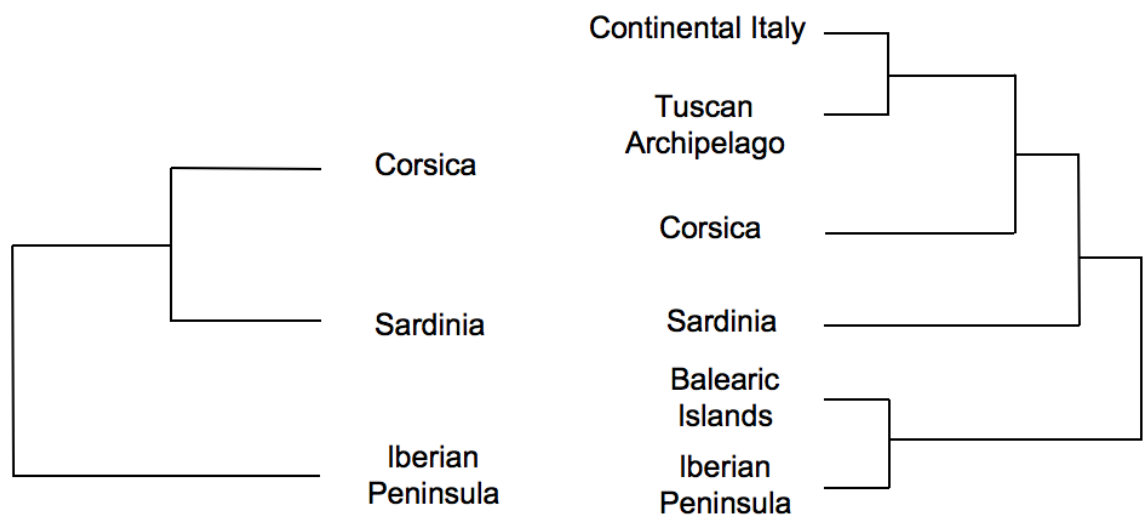
Figure 2. Geological area cladograms of the peri-Tyrrhenian area. The cladogram on the left depicts relationships only when the three major landmasses are considered while on the right are expected relationships when additional areas are also included (see text for details).