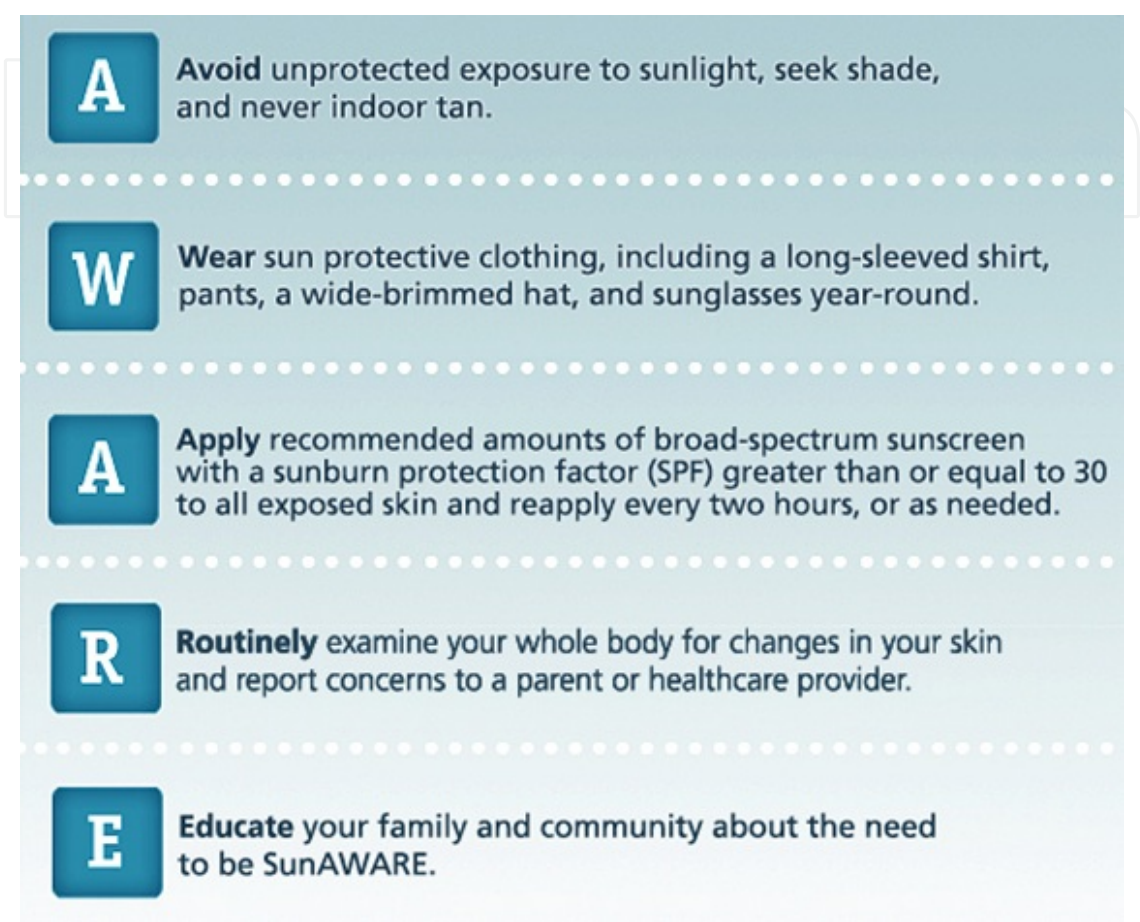
Figure 3. Sun protection advice displayed on SunAWARE website using the acronym AWARE. http://www.sunaware.org/be-sunaware/

awareness is encouraged by campaigns such as national “Don’t Fry Day” that takes place on the Friday before Memorial Day in the U.S. and is supported by the National Council on Skin Cancer and SunWise program [5, 51].