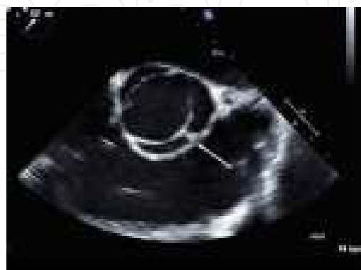
Figure 1. Transesophageal short-axis view of a BAV. There is fusion of the right and left cusps. The arrow points to the raphe.

The bicuspid valve is composed of two leaflets, of which one is usually larger (due to fusion of two cusps leading to one larger cusp), and unequal cusp size the presence of a central raphe (usually in the center of the larger of the two cusps). The raphe or fibrous ridge is the site of congenital fusion of the two components of the conjoined cusps and does not contain valve tissue (Figure 1) Three morphologies are identified: type 1, fusion of right coronary cusp and left coronary cusp; type 2, fusion of right coronary cusp and noncoronary cusp; and type 3, fusion of left coronary cusp and noncoronary cusp. The most common is type 1 (70% to 85%), followed by type 2 (10% to 30%) and most rare type 3 (1%) [13,19,26] (Figure 2).