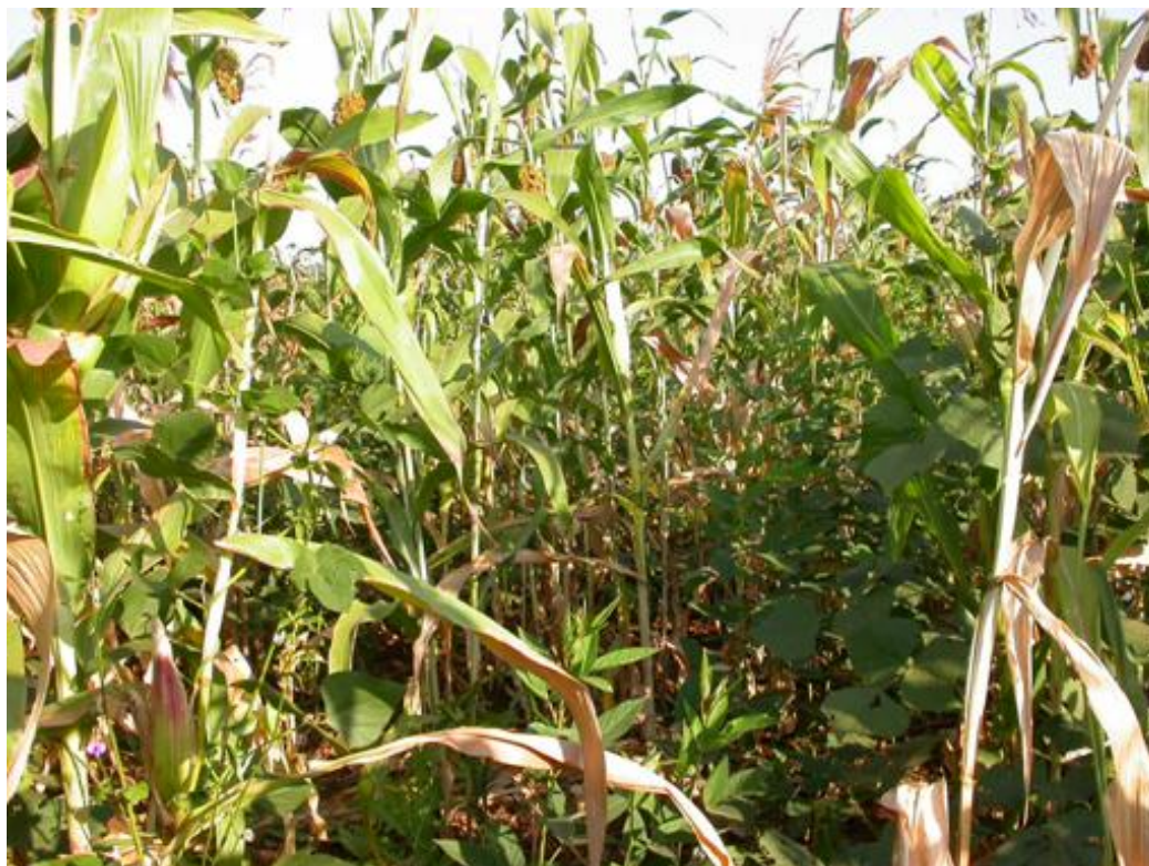
Figure 1. A mixed cropping system consisting of pigeonpea (foreground), corn, sorghum and cowpea.

field conditions. The specific objectives were to evaluate the germplasm for (i) sensitivity to photoperiod (ii) reaction to fusarium wilt (iii) reaction to insect pests and (iv) grain quality traits that are preferred by end-users.