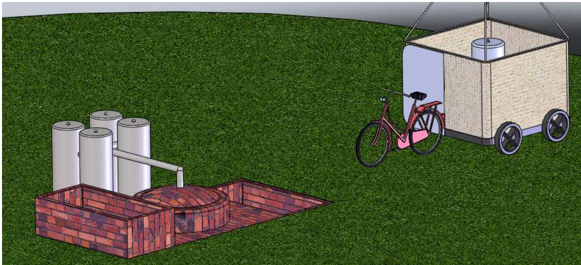
Figure 3. Image Renders of Bio-digester, Bicycle and Basket