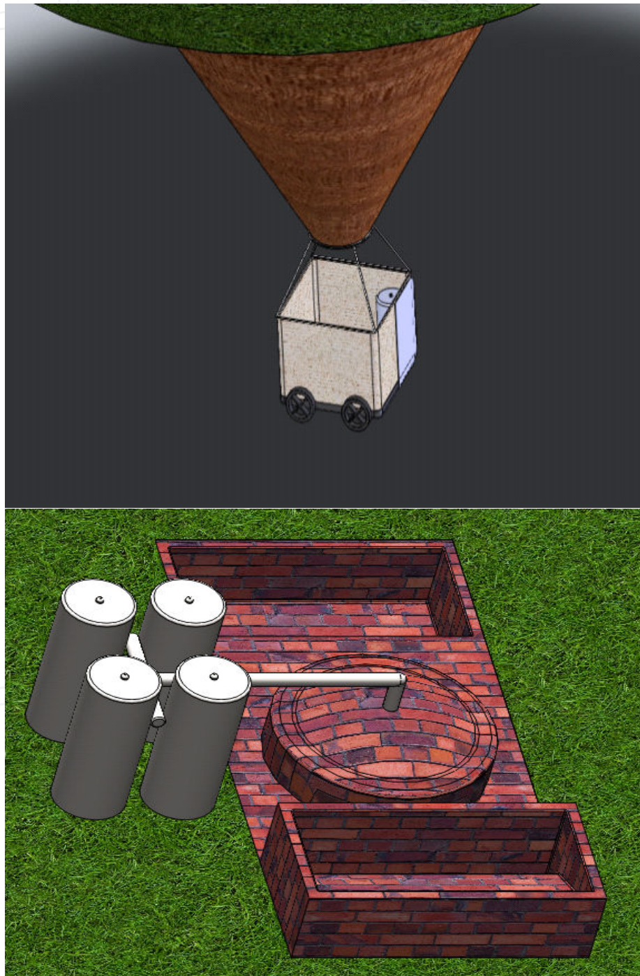
Figure 2. Renders – Basket and Bio-digester