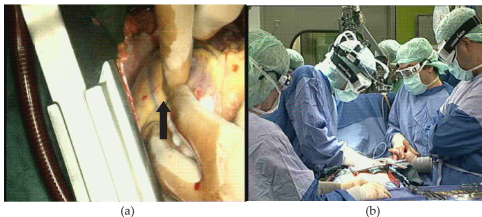
Figure 2. Intraoperative mapping with a small fingerprobe (a) and laser photocoagulation with protective goggles (b)

If no aneurysm is present, the ventricle is generally not opened but mapping guided laser photocoagulation only performed epicardially. If in these cases no further epicardial focus can be mapped but a VT, mostly different to the initial clinical recording, is still inducible, the procedure must be terminated without complete cure, as already described above. According to our very strict protocol, all these patients receive an ICD in a second intervention.