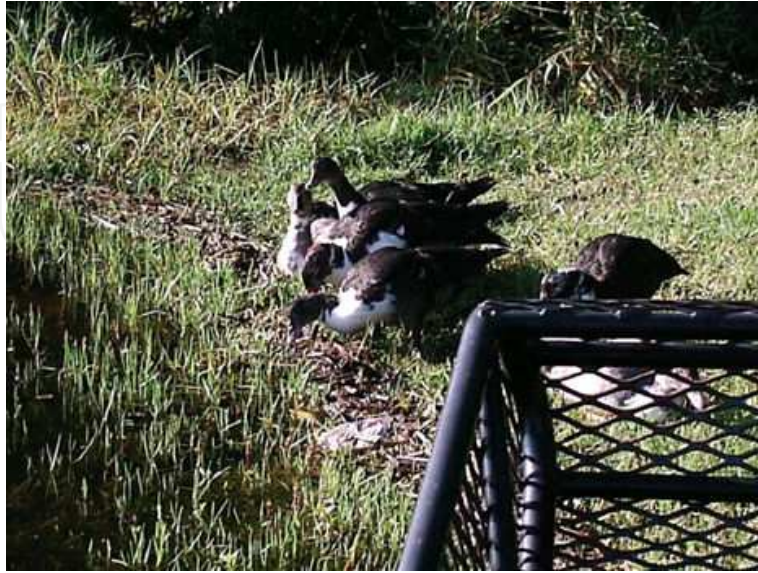
Figure 12. Ducks consuming seeds and vegetation on a pond bank.

submersed weeds necessitates weed control efforts that focus on eliminating as much vegetation as possible.