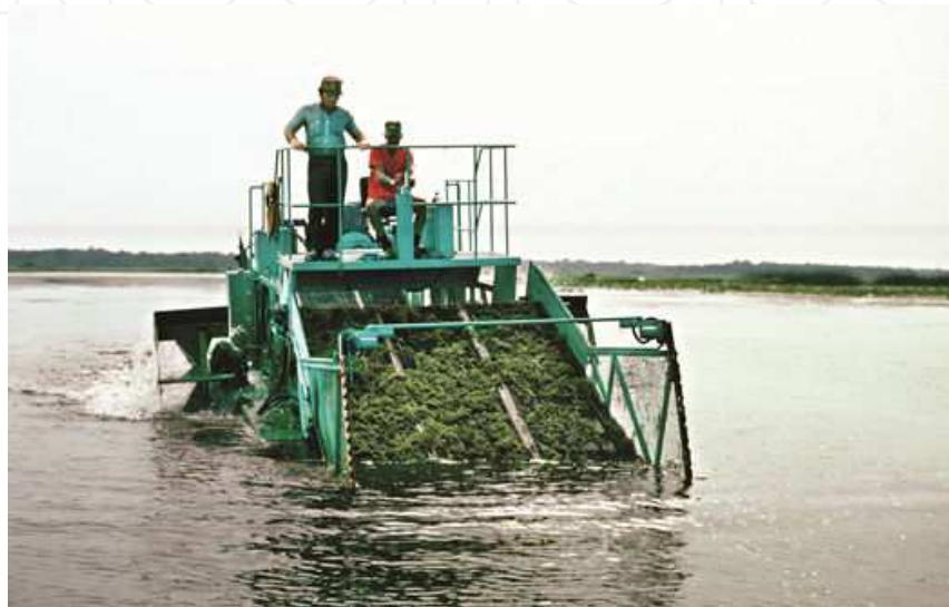
Figure 8. Mechanical harvesting of hydrilla.

similar in appearance to desirable native plants that should be allowed to remain in the system. In contrast, mechanical harvesters are “non-selective” – they indiscriminately remove all plant material in the harvesting zone and are unable to distinguish between weeds and native species. Also, mechanical harvesters often result in bycatch, or the removal of fish and other aquatic fauna along with plant material. This problem is most pronounced when shallow-water (upper 5 feet; 1.5 m) harvesters are employed and can result in the removal of up to 28,000 fish per acre [23], but bycatch can be reduced by greater than 99% (removal of around 120 fish per acre) when deep-water (upper 10 feet; 3 m) harvesting is utilized [24].