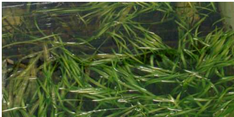
Figure 11. Eelgrass.

Flood control canals should be able to quickly move large volumes of water. These systems may be used only rarely for their true purpose; however, their ability to function as intended is critical when residential or developed areas are threatened by tropical storms, hurricanes or other extreme weather events. As such, it is critical that these canals be kept clear of aquatic vegetation that may impede the flow of water. A “scorched earth” philosophy and the use of a non-selective herbicide is sometimes employed to ensure that flood control canals remain free of aquatic weeds, and native plants are not exempt from weed control efforts in these systems. This is because even a small population of submersed plants – be it a weed such as hydrilla or a native plant such as eelgrass ( Vallisneria americana Michx.) (Fig. 11) – can severely restrict water flow and increase the likelihood of flooding. Although the goal of weed control efforts in flood control canals is often to eliminate as much vegetation in the water column and surface as possible, canal banks should remain vegetated (ideally with a well-rooted, non-invasive native species) to prevent erosion during periods of rapid flow.