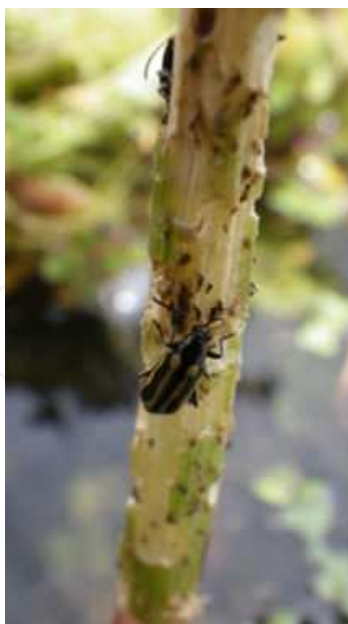
Figure 10. Alligatorweed flea beetle.