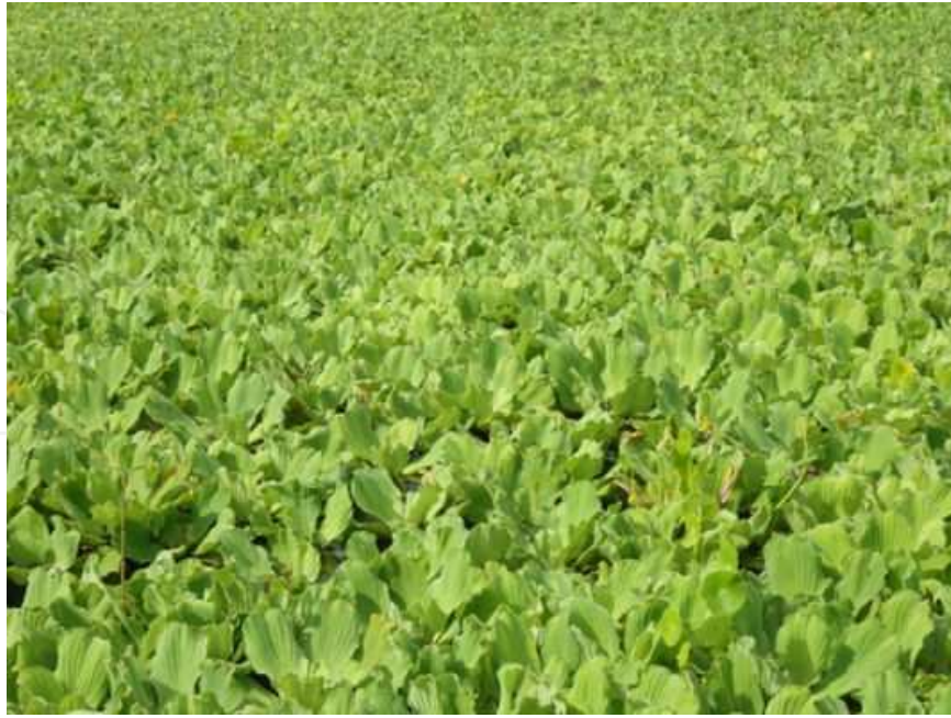
Figure 6. Waterlettuce.

public waters. Although this sort of intentional release is certainly a vector for the introduction of new invaders (see Section 2 of this chapter describing the introduction of waterhyacinth), accidental transfer of aquatic weeds frequently occurs when boats, trailers, and other equipment is moved from an invaded site to a pristine body of water (Fig. 7). The likelihood of introduction via this route can be reduced by requiring careful inspection of any object before movement from one body of water to another. This is especially important when boats and other equipment are being relocated from a body of water that is suspected of or known to harbor invasive species to one that is pristine. These inspections can identify seeds, vegetative fragments, larvae, veligers, and other propagules of invasive aquatic species and ensure their removal before launching at a new site, thus preventing the introduction of exotic organisms into an uninfested body of water. This method has been employed with some success in the northern US, where rigorous boat inspection programs have kept invasive aquatic plants and animals such as zebra and quagga mussels ( Dreissena polymorpha and D. rostriformis bugensis , respectively) from spreading to new sites [20, 21].