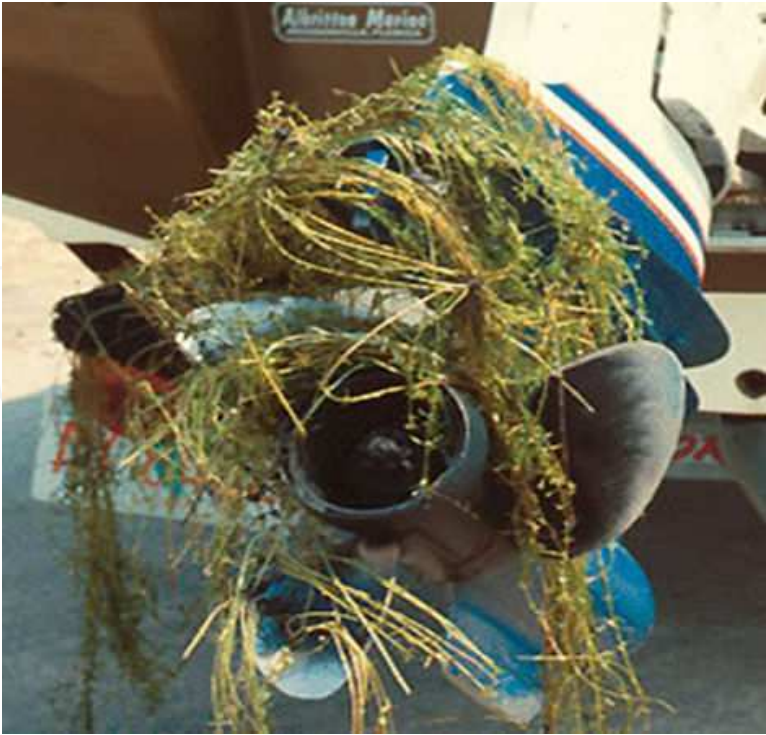
Figure 4. Boat motor clogged with hydrilla.

Chinese grass carp ( Ctenopharyngodon idella Val.) [15, 16], but the vast majority of resource managers rely on chemical control to keep the growth of hydrilla in check.