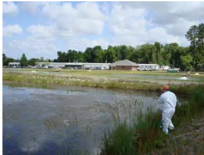
Figure 13. Herbicide applicator wearing personal protective equipment.