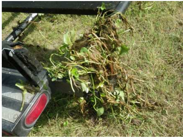
Figure 7. Aquatic weeds on a boat trailer.