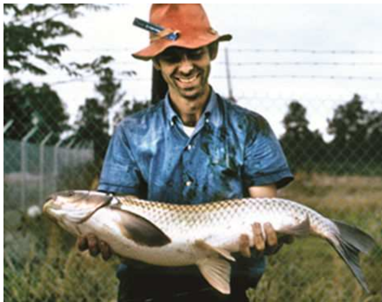
Figure 9. Asian grass carp.

vegetation in an aquatic system. Also, because the grass carp is a non-native introduced species, special precautions must be taken to reduce the likelihood of these biocontrol agents becoming invasive themselves. In Florida and many other states in the US, a permit must be issued by state resource managers before the introduction of grass carp into an aquatic system (although some states prohibit the use of grass carp as biocontrol agents altogether) [28]. In most cases, permit holders must ensure that stocked waters are secured (i.e., water intakes and outflows must be screened) to prevent the fish from escaping into other waters and all released grass carp must be triploid. Triploidy is the presence of an additional set of chromosomes, a condition that is induced by subjecting fish eggs to cold, heat, or pressure shock treatments immediately after artificial fertilization, and renders the grass carp unable to reproduce [29].