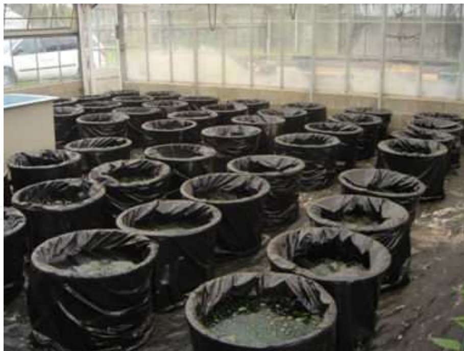
Figure 15. Efficacy testing in the greenhouse.

It is important to note that all herbicides labeled for aquatic weed control by the USEPA in the US are “general use” pesticides that can be purchased and applied by anyone, including homeowners and unlicensed applicators. However, the USEPA allows states to apply addi-