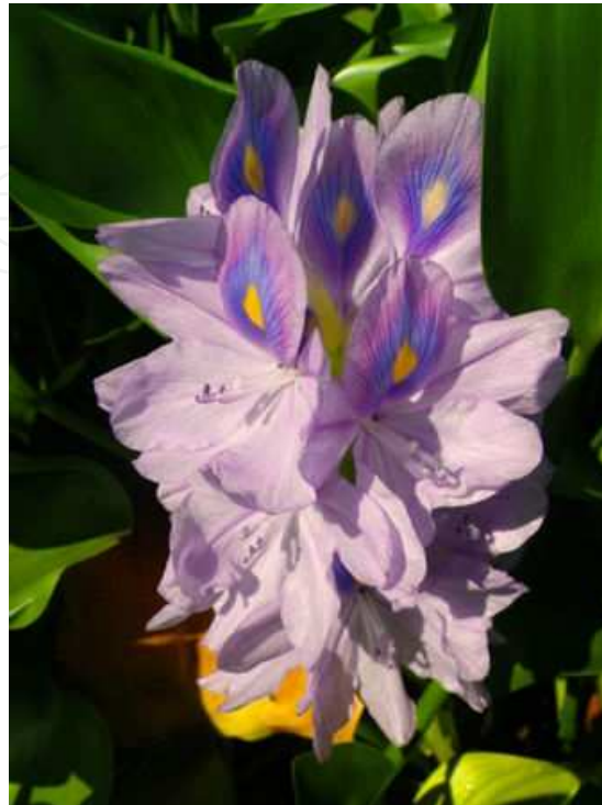
Figure 1. Waterhyacinth.

others by tossing his extra plants into the St. Johns River [2]. Within a decade, the St. Johns was so clogged with waterhyacinths that navigation had become impossible [1-3].