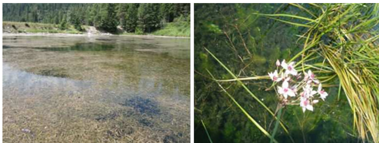
Figure 5. Other common aquatic invaders in the US. Left: curlyleaf pondweed. Right: flowering rush (emerged) and Eurasian watermilfoil (submersed).

Waterhyacinth and hydrilla quickly establish and become invasive in virtually all areas where they have been introduced, but these species are not the only aquatic plants that cause problems in natural systems, reservoirs, and canals through the world. For example, resource managers charged with protecting the waters of the Pacific Northwest and many other parts of the US struggle with invasions of Eurasian watermilfoil ( Myriophyllum spicatum L.), flowering rush ( Butomus umbellatus L.), and curlyleaf pondweed ( Potamogeton crispus L.) (Fig. 5). It is thought that these species were initially introduced through the aquarium and nursery trade, but have since spread throughout the country's waters as a result of improper or inadequate cleaning of contaminated equipment that has been moved from infested sites to pristine waters.