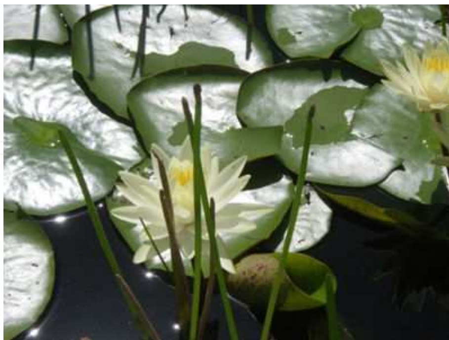
Figure 14. Waterlilies in a development pond.

market for aquatic weed control products is much smaller; for example, public agencies in Florida spent around $22.5 million in 2005 to manage aquatic invaders in public waters [42]. Any product that is marketed in the US to control pests – including weeds – must first be labeled by the US Environmental Protection Agency (USEPA or the Agency). Obtaining a pesticide label from the USEPA is a time-consuming and expensive undertaking; the Agency requires registrants (the manufacturer or group seeking a pesticide label) to submit data from more than 100 tests before a product can be evaluated for possible labeling, and the testing process typically requires the investment of tens of millions of dollars [43]. These tests are conducted to determine the effects of the experimental pesticide on the organism targeted for control, but also to assess its impact on non-target organisms, human health, and the environment as well. USEPA regulation of pesticides began with the adoption of the Federal Insecticide, Fungicide, and Rodenticide Act (FIFRA) in 1947; FIFRA has since been amended multiple times, most notably by the Federal Environmental Pesticide Control Act of 1972, and continues to serve as the primary process to ensure that human health and the environment are not negatively impacted by the use of pesticides [43].