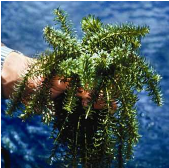
Figure 3. Hydrilla.

Chinese grass carp ( Ctenopharyngodon idella Val.) [15, 16], but the vast majority of resource managers rely on chemical control to keep the growth of hydrilla in check.