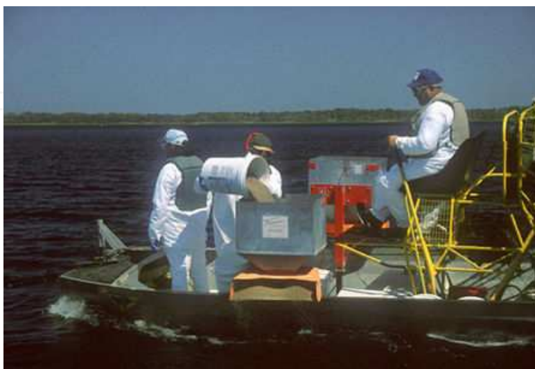
Figure 17. Application of granular herbicide using a boat-mounted spreader.