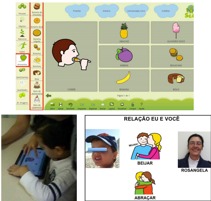
Figure 6. the use of SCALA with subjects with autism in the tablet and a board with symbols

Subject 3, through mediating actions accepts touch and demonstrates affection through kisses and hugs. Aggression is only expressed when he feels some pain. His interactions with the object increase and he starts participating in some mediating actions with the researcher. Only one word was said after great insistence, but the symbols of alternative communication start being understood, which is likely to contribute to his way of communication soon.