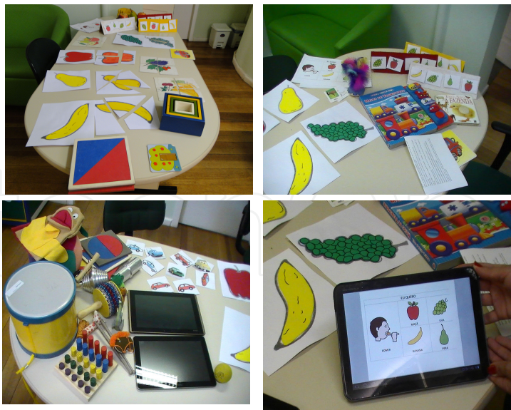
Figure 3. Example of AC material of low and high technology