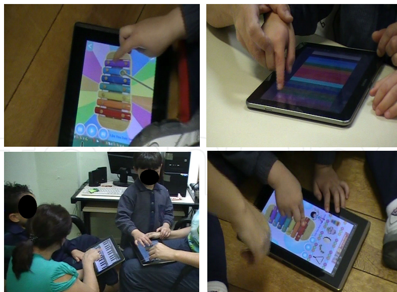
Figure 4. Using different tablet applications