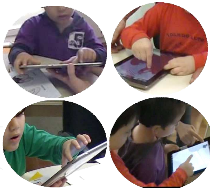
Figure 5. Using tablets with subjects with autism

With the use of tablets, we could notice attention spans increased for all the subjects. Speech was also prompted in all mediations. So, subjects' range of vocabulary has increased. Subject 1 showed easiness with the technology and the participation as an intentional agent in mediated actions. He is currently producing more words with two syllables and participating in scenes of joint attention in the mediations with other subjects.