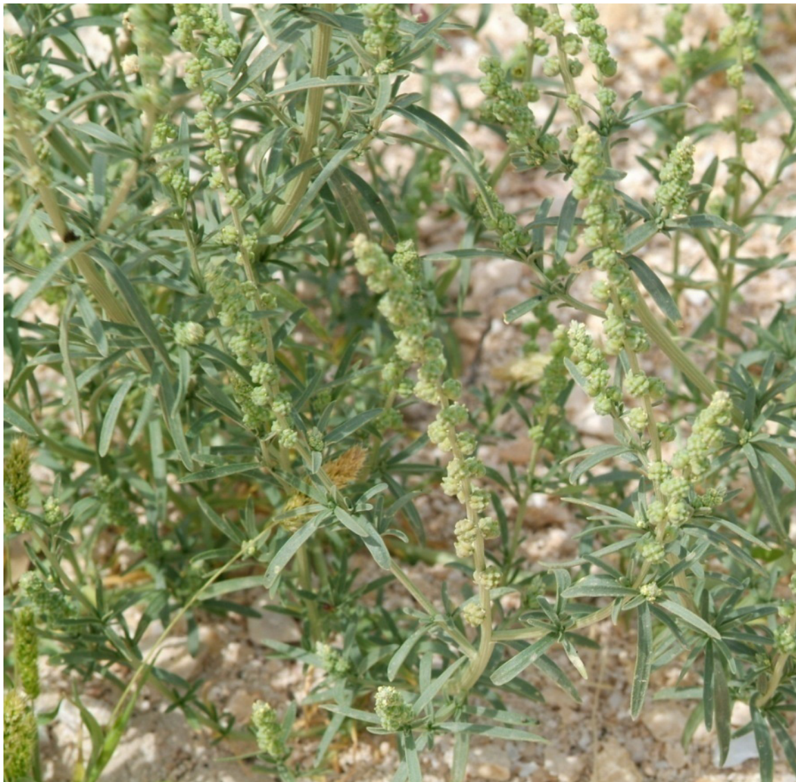
Figure 4. Oligomeris linifolia habit.

also by osmotic adjustment [15, 39] through accumulation of substantial amounts of organic and inorganic solutes like proline, glycinebetaine, sugars and inorganic ions to cope with soil of severe water shortage [3, 40-42]. Plants such as Tetraena qatarense and Ochradenus baccatus , are good examples of xerophytes having dehydration avoidance mechanism by accumulating solutes to withstand severe water stress [4]. Dehydration tolerance mechanism, on the other hand, includes some methods like avoidance of starvation strain by stomatal opening at low \Psi_w , uncoupling of photosynthesis from transpiration, low respiration rate and other secondary mechanisms include: tolerance of starvation strain, avoidance of protein loss, and tolerance of protein loss [15]. Understanding these secondary mechanisms needs extensive and deep investigation in the plants covered in this review.