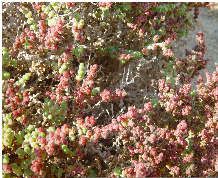
Figure 6. Halopeplis perfoliata habit.