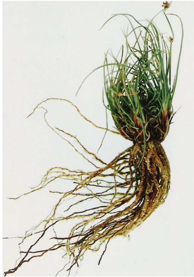
Figure 2. Cyperus conglomeratus has high root / top ratio.