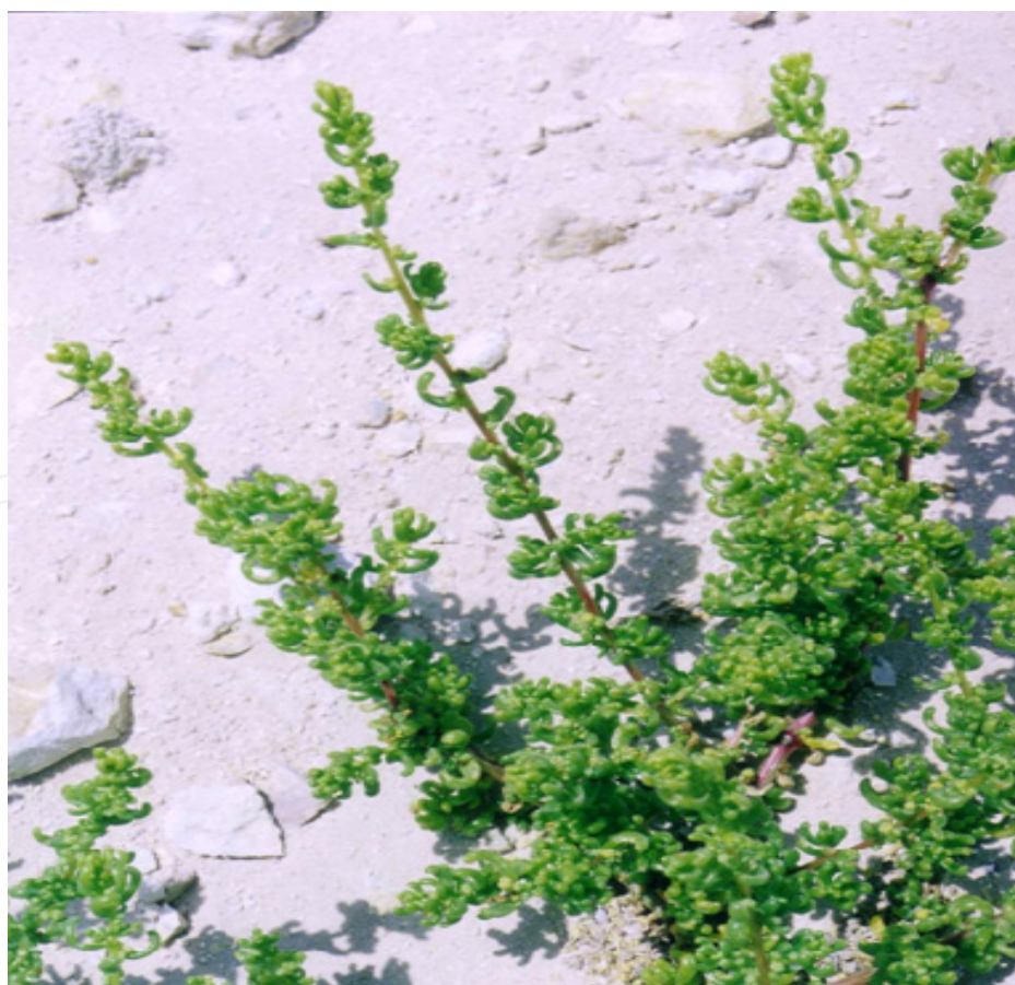
Figure 7. Suaeda aegyptiaca shoots.