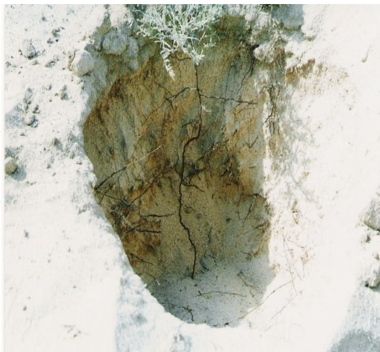
Figure 5. Some plants have roots growing in the deeper soil layers toward the water table, Helianthemum lipii .