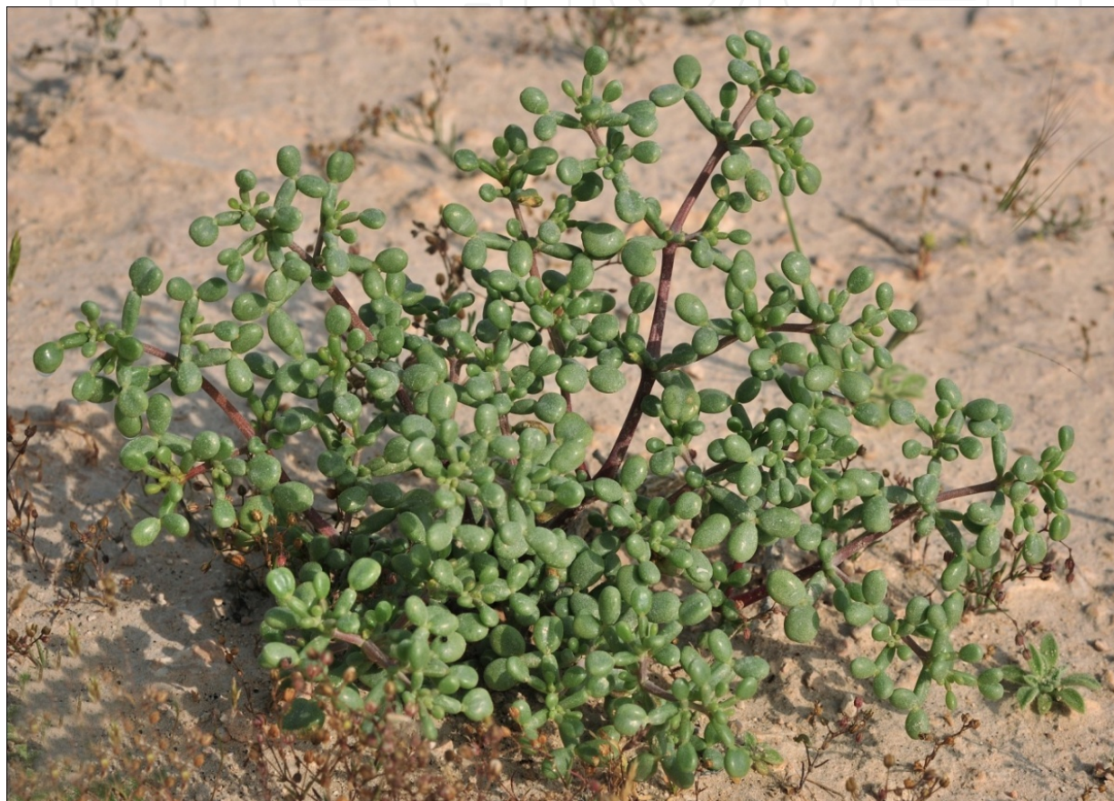
Figure 3. Branches of Tetraena qatarense with the fleshy leaves and woody stems.

in spite of its succulence characteristic and its ability to store water in different plant parts (Fig. 4). This species has been considered as a desert species suspected as halophyte. Its life form was considered as Sub-Fruticose Chamaephytes, erect fruit shoot at base [38]. It grows in various habitats, including disturbed areas and saline soils, in deserts, plains, coastline, and other places. It is a fleshy annual plant, producing several erect, ribbed stems 35 to 45 centimeters in maximum height. Although these plants are considered as xerophytes, they might have also well adapted to saline environments, since they are living in soils of high salinity levels [4].