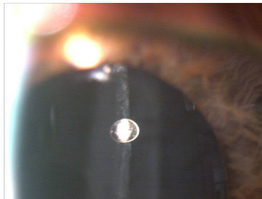
Fig. 2. Intraocular ointment drop in the anterior chamber

Even though TASS is defined as an acute inflammation, it is not rare to find TASS delayed days after surgery. It is usually caused by intraocular lenses (chemicals used in packaging, polishing, cleaning or sterilization of the lens) or even ocular ointments (Figure 2). An outbreak was reported by Werner when ocular ointment containing petroleum was associated to tight ocular postoperative patching (Werner et al., 2006).