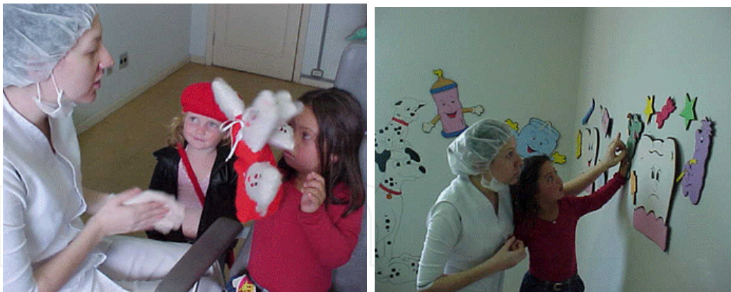
Figure 5. Constant guidance and motivation

Second Nielsen [26] (1990), the type and degree of disability are also important factors, since the greater the degree of mental deficiency the worse the level of hygiene.