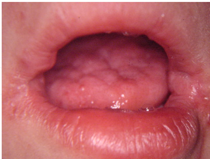
Figure 1. Pseudomacroglossia due to hypotonia tongue

There is agreement among many authors on the existence of factors predisposing to periodontal disease in patients with Down syndrome. Although poor oral hygiene, poor nutrition and local irritants may exacerbate this problem, they can not be regarded as its main cause. The greater predisposition to periodontal disease has been attributed to characteristics of patients with chromosomal abnormalities of trisomy [5] It is therefore essential to establish strategies to prevent periodontal disease in these individuals.