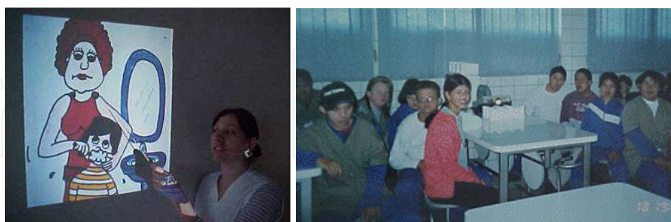
Figure 4. Lecture to motivate the control of biofilm

The manual dexterity and, many times, the motivation, are indispensable factors for efficient oral hygiene through mechanical means in patients with Down syndrome [18]-[22]. Thus, the key to success in promoting and maintaining a satisfactory oral health in these patients is the application of a rigorous program of oral hygiene constant [23].