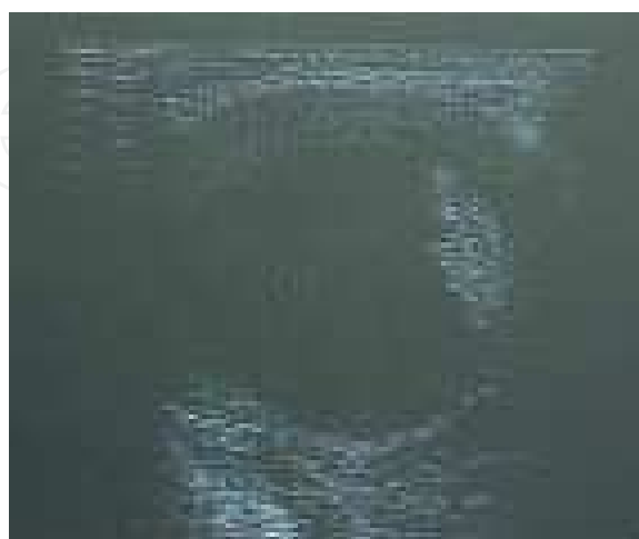
Figure 2. Aneurysm of the cephalic vein with parietal thrombus

A Doppler examination of the aneurysm shows turbulent blood flow and parietal thrombus (figure 2). The natural evolution of this complication is with total thrombotic occlusion or spontaneous rupture. Other associated processes are thrombophlebitis, infection, skin necrosis with imminent perforation and hyperdynamic syndrome[8]; these all require surgical treatment. Also, a quickly evolving aneurysm requires surgical intervention. Otherwise, the undilated segments of the fistula can be used for hemodialysis access[9].