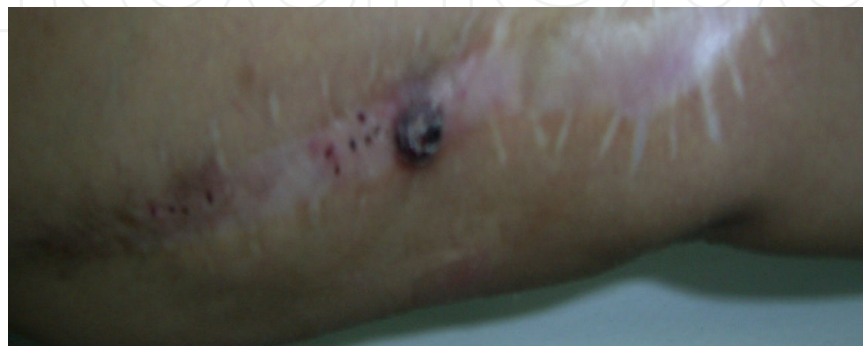
Figure 3. Skin necrosis at the level of a superficialized basilic vein

Skin necrosis also develops at the site of repeated punctures. It occurs after superficialization of a basilic or brachial vein, if the wound had been closed with a thin layer of skin overlying the fistula (figure 3). This heals poorly between HD sessions, as it has an inadequate blood supply, and becomes even thinner and necrotic; the venous wall is also thin and very fragile. Bleeding is the risk with this complication, and can be massive, life-threatening due to the high flow through the fistula (figure 4).