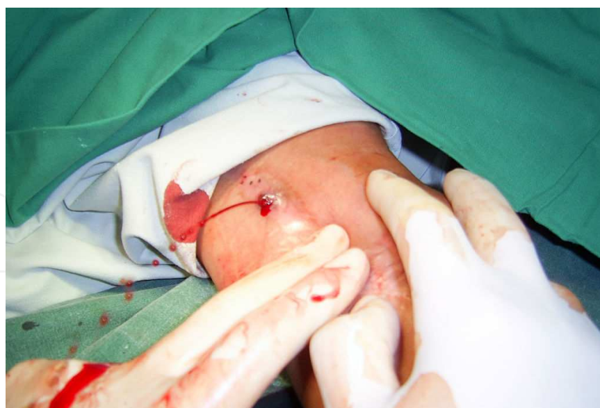
Figure 4. Bleeding from the necrotic skin area

Surgical treatment involves the bleeding point skin suture, then making a circular incision around the necrotic segment and carefully dissecting it away from the vein, without entering the vein.