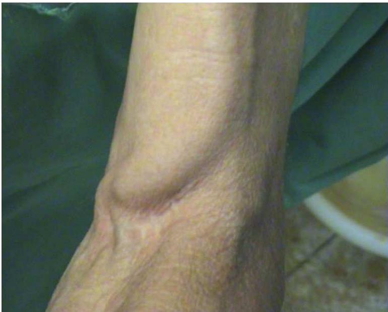
Figure 6. Accessory radial vein with a high origin in a patient with a brachio-cephalic fistula

cephalic vein. Even after arterialization of the cephalic vein, this branch maintains a small diameter and can be used to divert the blood flow from the larger cephalic vein (figure 6).