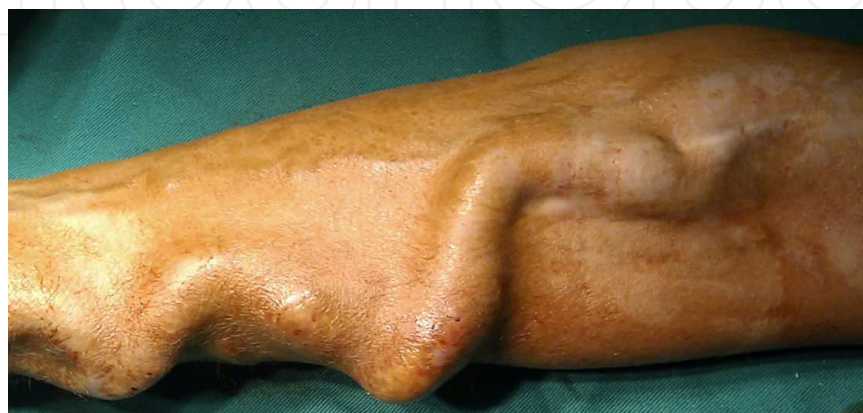
Figure 1. Aneurysm of the cephalic vein in a patient with a radio-cephalic fistula

Venous aneurysm occurs in uncorrected hypertensive patients, months or years after fistula construction, irrespective of the fact that the fistula has or has not been used for HD (figure 1). The incidence of this complication was 3.6% (30 patients) in our group and 4.2% in the group from Cameroon [1].