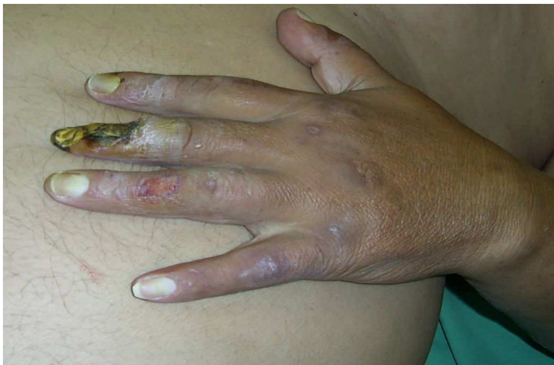
Figure 5. Ischemic hand and necrosis of the fingers in a patient with a brachio-cephalic fistula

All attempts should be made to salvage the limb firstly, and the fistula, secondly. The most direct and simple technique is outflow ligation. The vein is exposed close to the anastomosis and doubly ligated with a number 5 Nylon tape. The thrill should disappear and distal perfusion is immediately improved, with quick remission of symptoms. The major drawback is that the AVF is lost for further access.