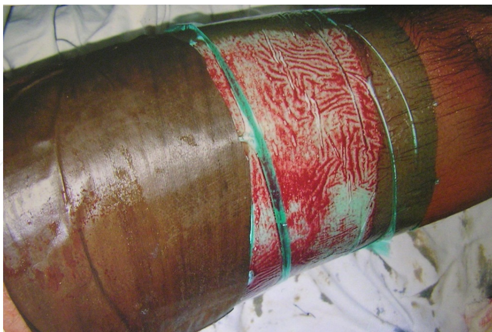
Figure 3. Application of BLD and PSD on donor area