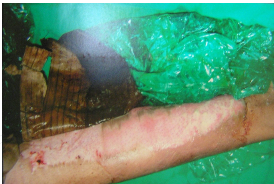
Figure 4. Epithelisation under BLD and PSD

The dressing on donor area was opened on 7 th post-harvest day, unless indicated earlier. Thereafter, the dressing was changed and area was inspected every day till complete epithelisation. (Fig 4)