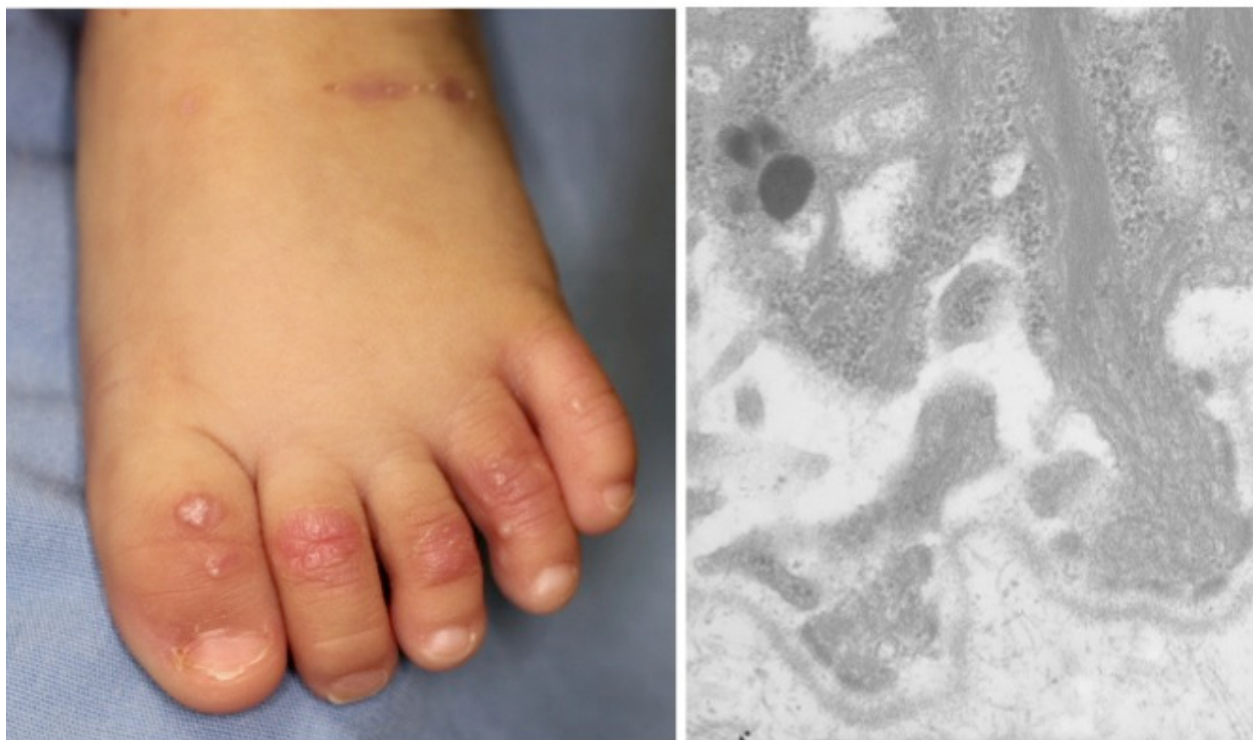
Figure 2. Clinical (left) and electronmicroscopical (right) appearances of dystrophic epidermolysis bullosa patient.