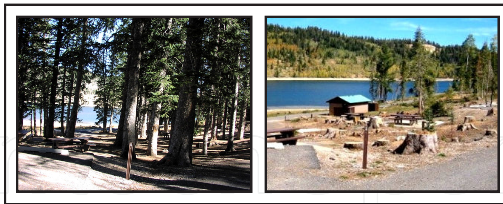
Figure 2. Conditions before (left) and after (right) a spruce beetle outbreak impacted the Navajo Lake Campground on the Dixie National Forest, Utah, U.S. Daily use decreased substantially due to reductions in shade, screening and aesthetics associated with mortality and removal of large diameter overstory trees.

Although once common, insecticides are rarely used today for direct or remedial control (i.e., subsequent treatment of previously infested trees or logs to kill developing and/or emerging brood). While remedial applications have been demonstrated to increase mortality of brood in treated hosts, there is limited evidence of any impact to adjacent levels of tree mortality. Furthermore, there are concerns about the effects of remedial treatments on non-target invertebrates, specifically natural enemy communities. Many of these species respond kairomonally to bark beetle pheromones and host volatiles, and their richness increases over time [6], suggesting that the later remedial treatments are applied the more likely non-target organisms will be negatively impacted.