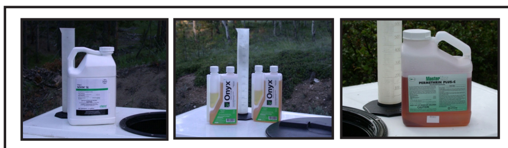
Figure 3. The carbamate carbaryl and pyrethroids bifenthrin and permethrin are commonly used to protect trees from bark beetle attack in the western U.S. Several formulations are available and effective if properly applied. Residual activity varies with active ingredient, bark beetle species, tree species, geographic location, and associated climatic conditions.

draws, non-payment of annual registration maintenance fees, and registration of new products at federal and state levels. Several studies have been published on the efficacy of various classes, active ingredients, and formulations that are no longer registered [e.g., benzene hexachloride (Lindane ® )]. Therefore, we limit much of our discussion to the most commonly used and/or extensively-studied products (Fig. 3). A list of products registered for protecting trees from bark beetle attack can be obtained online from state regulatory agencies and/or cooperative extension offices, and should be consulted prior to implementing any treatment. Furthermore, all insecticides registered and sold in the U.S. must carry a label. It is a violation of federal law to use any product inconsistent with its labeling. The label contains abundant information concerning the safe and appropriate use of insecticides (e.g., signal words, first aid and precautionary statements, proper mixing, etc.). For tree protection, it is important to note whether the product is registered for ornamental and/or forest settings, and to limit applications to appropriate sites using suitable application rates.