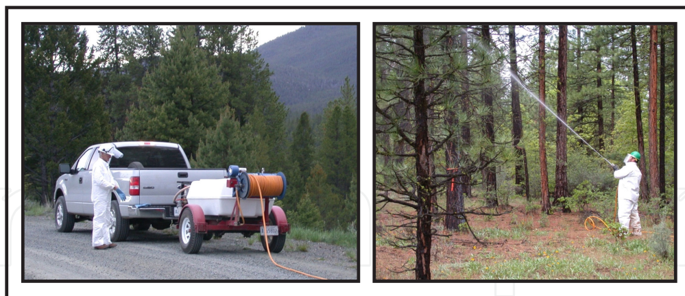
Figure 4. A common method of protecting trees from bark beetle attack is to saturate all surfaces of the tree bole using a ground-based sprayer at high pressure.

Bole sprays are typically applied in late spring prior to initiation of the adult flight period for the target bark beetle species. However, bole sprays require transporting sprayers and other large equipment, which can be problematic in high-elevation forests where snow drifts and poor road conditions often limit access. Additionally, many recreation sites (e.g., campgrounds) where bole sprays are frequently applied occur near intermittent or ephemeral streams that are associated with spring runoff, limiting applications in late spring due to restrictions concerning the use of no-spray buffers to protect non-target aquatic organisms. For these and other reasons, researchers are evaluating alternative timings of bole sprays and less laborious delivery methods.