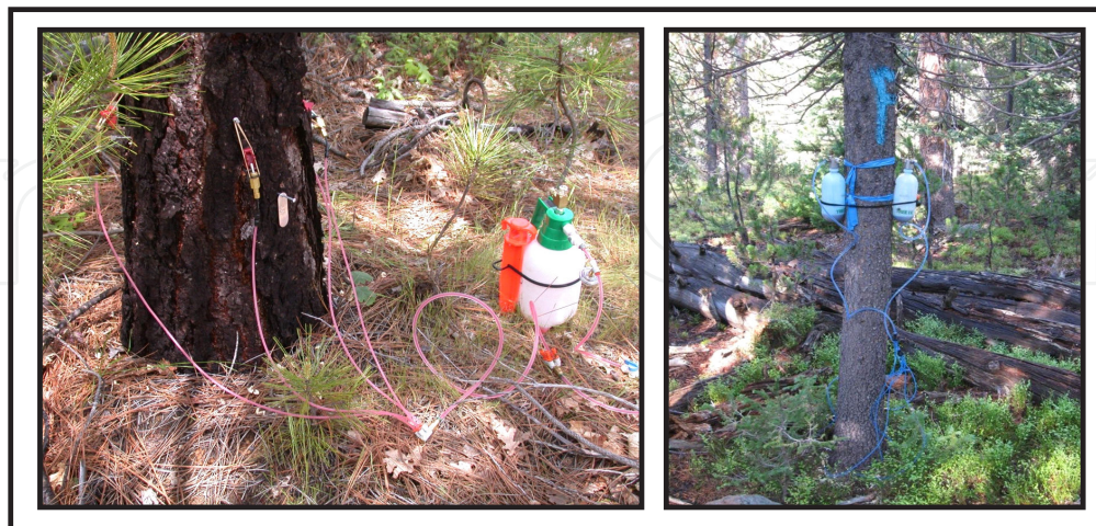
Figure 5. Experimental injections of emamectin benzoate for protecting trees from western pine beetle attack in Calaveras County, California, U.S. (left), and mountain pine beetle attack in the Uinta-Wasatch-Cache National Forest, Utah, U.S. (right).