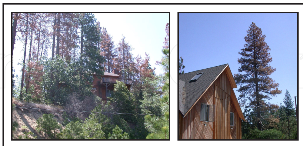
Figure 1. Tree mortality attributed to western pine beetle in San Bernardino County, California, U.S. In the wildland urban interface, tree losses pose potential hazards to public safety and costs associated with hazard tree removals can be substantial. Furthermore, property values may be significantly reduced. The value of these trees, cost of removal and loss of aesthetic value often justify the use of insecticides to protect trees from bark beetle attack during an outbreak.

Preventative applications of insecticides involve topical sprays to the tree bole (bole sprays) or systemic insecticides injected directly into the tree (tree injections) [3]. Systemic insecticides applied to the soil are generally ineffective. In an operational context, only high-value, individual trees growing in unique environments or under unique circumstances are treated. These may include trees in residential (Fig. 1), recreational (e.g., campgrounds) (Fig. 2) or administrative sites. Tree losses in these environments result in undesirable impacts such as reduced shade, screening, aesthetics, and increased fire risk. Dead trees also pose potential hazards to public safety requiring routine inspection, maintenance and eventual removal [4], and property values may be negatively impacted [5]. In addition, trees growing in progeny tests, seed orchards, or those genetically resistant to forest diseases may be considered for preventative treatments, especially if epidemic populations of bark beetles exist in the area. During large-scale outbreaks, hundreds of thousands of trees may be treated annually in the western U.S., however once an outbreak subsides (i.e., generally after one to several years) preventative treatments are often no longer necessary.