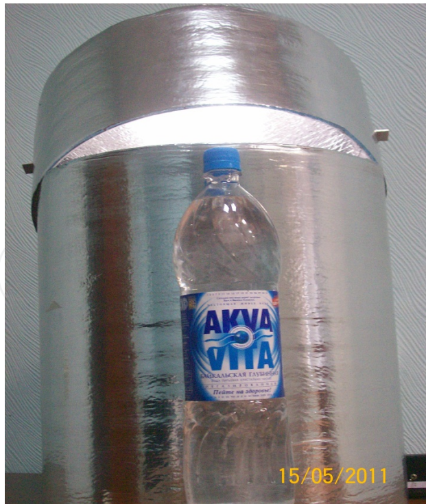
Figure 2. The screening device "TRODR-1" for light-holographic treatment of drinking water in the weakening geo-magnetic field (A. Trofimov, G. Druzhinin, 2011)