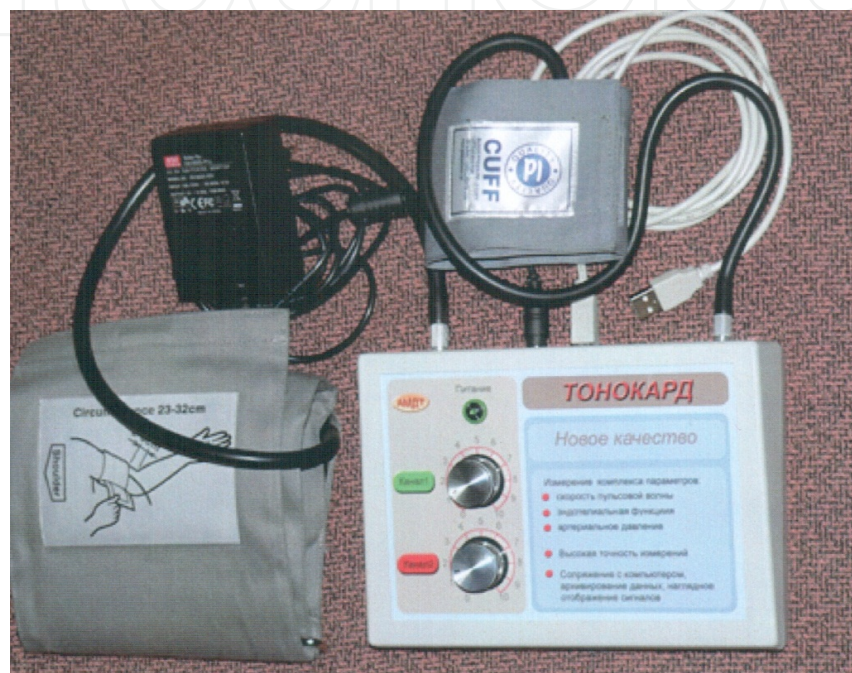
Figure 3. The device "Tonocard"

To determine the functional state of the cardio-vascular system the device "Tonocard" (Russia, Moscow) (Figure 3) was used. The device has Protocol № 14 П-09-24-044 of medical equipment, issued by 23.09.2009 by Federal Service on Surveillance in Healthcare and Social Development of Russian Federation.