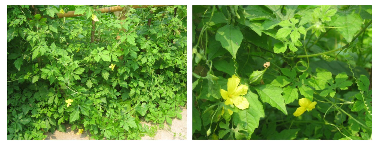
Figure 1. Flowers, immature fruit and young leaves of Momordica charantia (MC) at a home garden in Chiang Mai, Thailand (the picture was taken in March, 2012).

MC is an herbaceous, tendril-bearing vine growing up to 5 m in length. It bears simple, alternate leaves, with 3-7 deeply separated lobes. Each plant bears separate yellow male and female flowers [12]. Fruit 2.5-25 cm long, oblong, pendulous, fusiform, usually pointed or beaked, ribbed and bearing numerous triangular tubercles, 3 valves are present at the apex when mature. MC are perennial climbers cultivated throughout India and in Southern China and is now found naturalized in almost all tropical and subtropical regions. It is an important vegetable in India, Sri Lanka, Vietnam, Thailand, Malaysia, the Philippines and Southern China. It is also cultivated on a small scale in tropical America. MC is grown mainly for the production of immature fruit, although the young leaves are edible as a vegetable [3]. The young fruit is emerald green, but turns to orange-yellow when ripe. At maturity, the fruit splits into irregular valves that curl backwards and release numerous brown or white seeds encased in scarlet arils (Figure 1). All parts of the plant, including the fruit, taste bitter. It has been used extensively in traditional medicine as a remedy for diabetes.