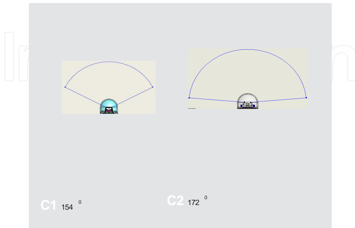
Figure 2. The left side image demonstrates the angle of view of the out dated C1 colon capsule. The right hand image demonstrates the angle of view of the C2 colon capsule with a near panoramic view.

The angle of view of this new colon capsule camera was extended from 154 to 172 degrees for each camera. This change provides a near full panorama view (see Figure 2).