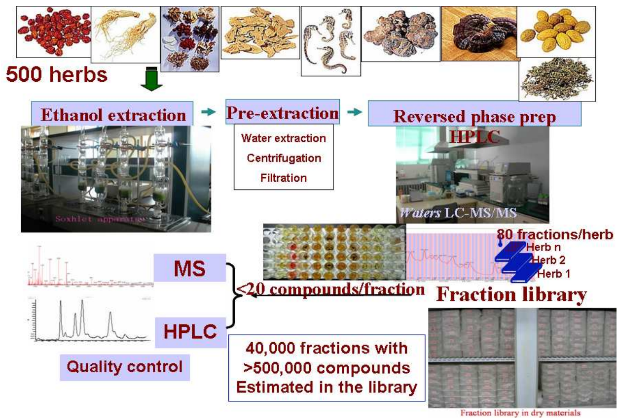
Figure 2. Schematic presentation of strategy of identification, isolation, structure elucidation, and screenings of Traditional Chinese medicines (TCM) against cancer cells.

The screening strategy has been shown in schematic form in Fig. 2. Several cancer cells, including SGC-7901, U87, PANC-1 and A-375 cells were cultured in DMEM supplemented with 10% fetal bovine serum and were exposed to different Chinese medicinal herbs extracts and TCM compounds.