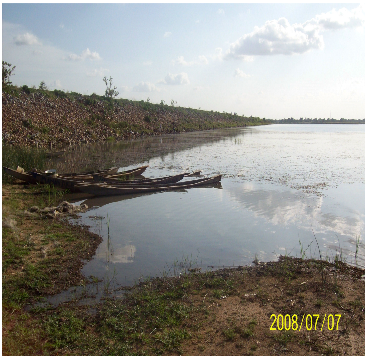
Figure 4. Rimin Gado dam, Rimin Gado area, Kano, Kano state, Nigeria.

is very prominent. Species of B. globosus and B. rohlfsi were collected there and water samples were taken.