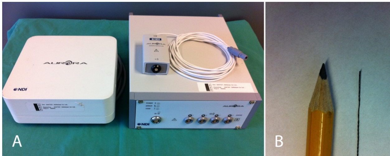
Figure 2. A) Electromagnetic tracking system - NDI Aurora. (B) Tracking sensor – 0.5 mm diameter

However, electromagnetic tracking systems are sensitive to disturbances created by metallic objects and electromagnetic noise. For Endovascular applications this is specially challenging since the X-ray/fluoroscopy imaging equipment represents a substantial dynamic disturbance (Bø et al., 2012). To make navigation feasible in these cases either the disturbing equipment (i.e. X-ray equipment) must be moved to a safe distance during navigation or a correction scheme must be applied. Several methods for compensating the disturbances have been reported in literature. The most common approach is to sample reference points throughout the tracking volume. The same points are sampled with and without disturbances present and this is used to map the deformation field caused by the disturbance (Kindratenko, 2000).